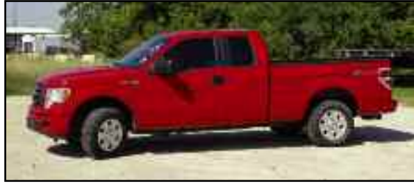
(97) FORD F150 PICKUP TRUCKS