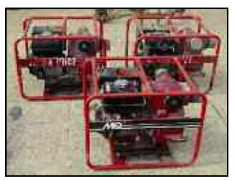
(3) MQ 3" TRASH PUMPS