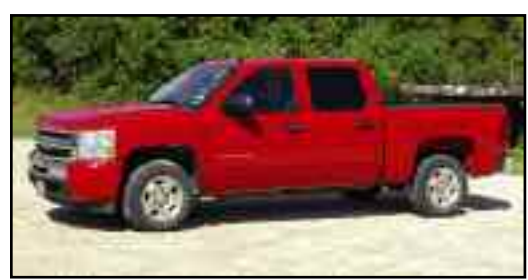
(26) CHEVROLET SILVERADO PICKUP TRUCKS