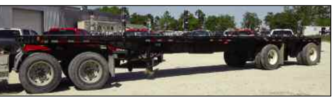
FREUHAUF 45' T/A FLATBED TRAILER