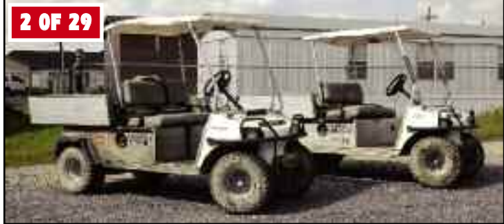
(29) CLUB CAR MAINTENANCE CARTS