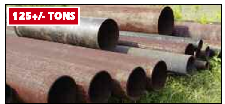
(125+/- TONS) 1-1/2" - 48" DIAMETER PIPE TO 40' LENGTHS