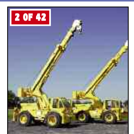
(42) GALION/DRESSER 150FA AND 150F 15-TON ROUGH TERRAIN CRANES