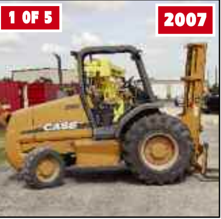
(5) CASE 586G ROUGH TERRAIN FORK LIFTS

(29) CLUB CAR Maintenance Carts, Model Carry All 252, Gas Engine