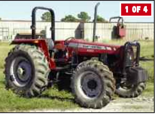
(4) MASSEY FERGUSON 583 FARM TRACTORS