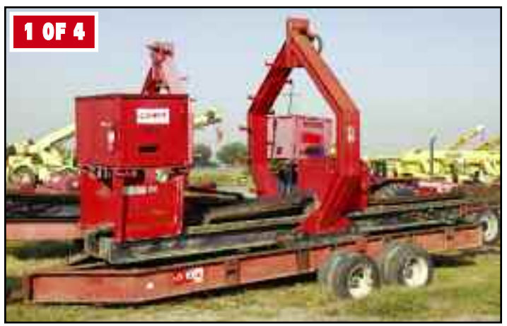
(4) PEINEMANN HYDRAULIC BUNDLE EXTRACTORS