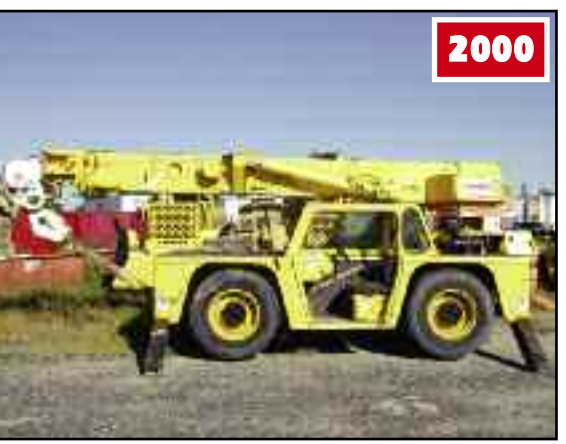
GROVE YB4415XT 15-TON CARRY DECK CRANE