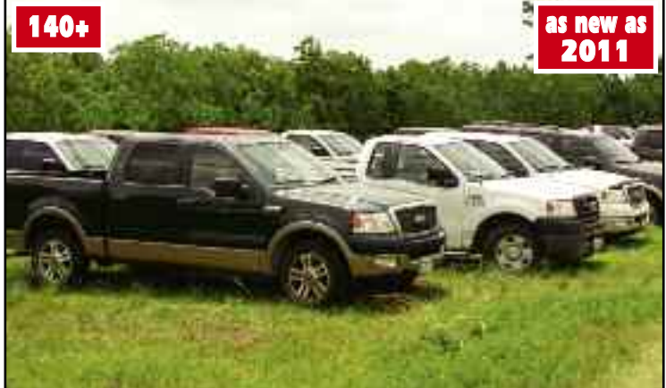
(140+) FORD F150 LARIAT, F150XL, F150, CHEVROLET SILVERADO 1500, 2500HD, 3500HD & GMC SIERRA PICKUP TRUCKS