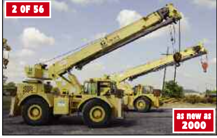
(56) GALION/DRESSER, GROVE & BRODERSON ROUGH TERRAIN & CARRY DECK CRANES