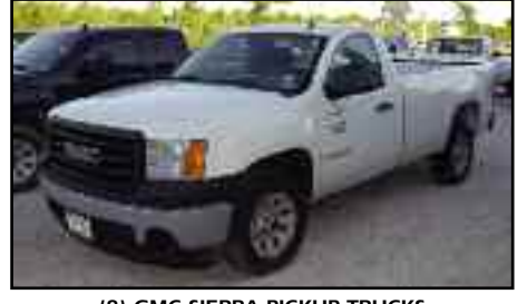
(8) GMC SIERRA PICKUP TRUCKS