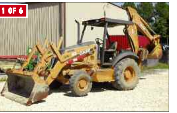
(6) CASE 580M SERIES 2 BACKHOES

INSPECTION: WEDNESDAY, NOVEMBER 30TH FROM 9AM TO 4PM