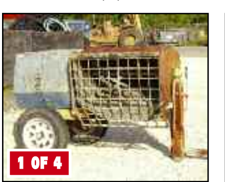
(4) STONE GAS POWER CEMENT MIXERS