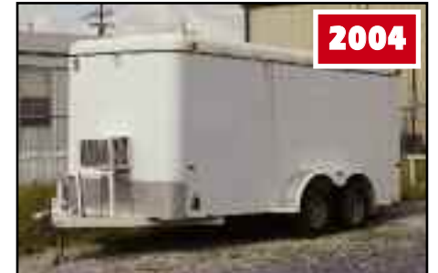
16' T/A UTILITY TRAILER