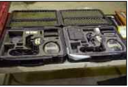
(2) SKF PIPE ALIGNMENT LASERS