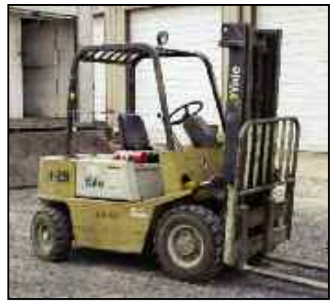
YALE 4,000-LB. FORK LIFT