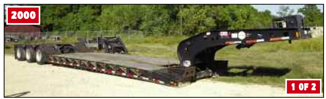
(2) FONTAINE TH55 DETACHABLE 55-TON LOWBOY TRAILERS

ALL ONLINE BIDS ARE SUBJECT TO A 15% BUYER'S PREMIUM