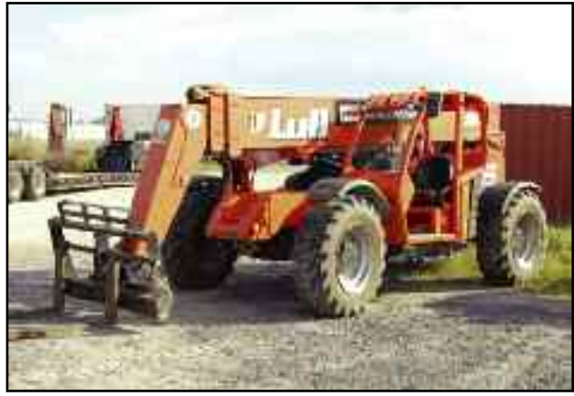
LULL 944E-42 9,000-LB. ROUGH TERRAIN FORK LIFT