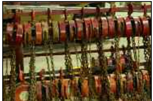
1- TO 3-TON CHAINFALL HOISTS