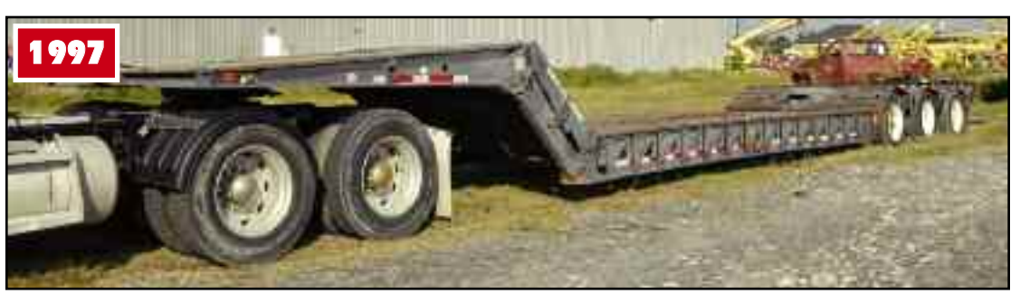
LOAD KING 50-TON 590' TRI-AXLE LOWBOY TRAILER