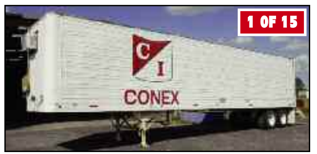
(15) 40' - 45' JOB SITE STORAGE & T/A WORK TRAILERS