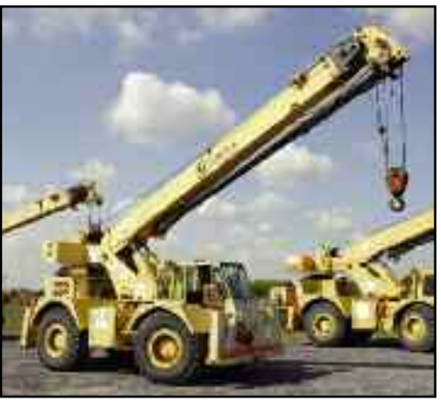
GROVE RT58C 18-TON ROUGH TERRAIN CRANE

4X4, Diesel, 40' Boom (2) BRODERSON Carry Deck Cranes, Model IC80, 17,000-lb. Capacity on Outriggers, 10,700-lb. Capacity on Rubber, 3-Stage Boom, 37' Vertical Reach, 30' Horizontal Reach, LP (3) BRODERSON 9,500-lb. Carry Deck Cranes, Model 1C-80-1D, Diesel, 36' Reach, Outriggers, S/N's 216435, 215920, 244457-parts/repair