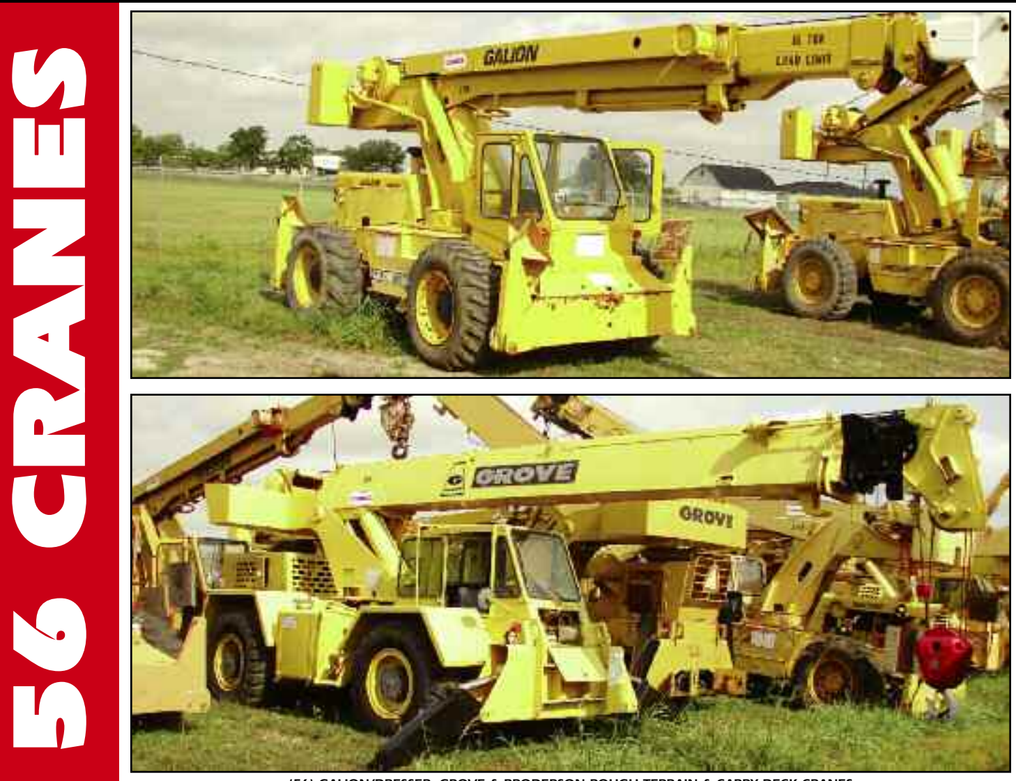
(56) GALION/DRESSER, GROVE & BRODERSON ROUGH TERRAIN & CARRY DECK CRANES