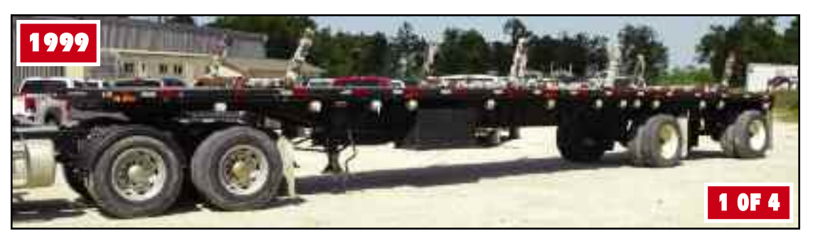
(4) TRANSCRAFT 48' FLATBED TRAILERS