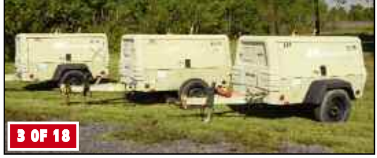
(18) INGERSOLL RAND 185P & 185XP DIESEL AIR COMPRESSORS