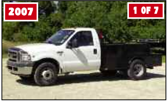
(7) FORD F350 FLATBED TRUCKS