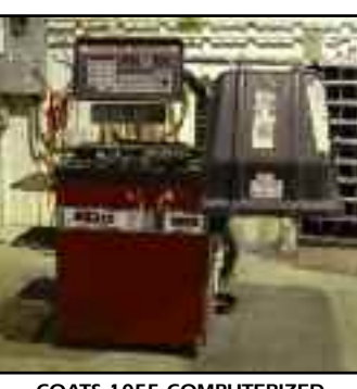
COATS 1055 COMPUTERIZED WHEEL BALANCER