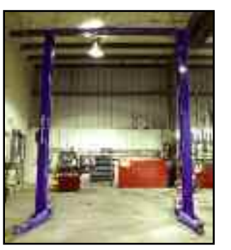
QUALITY Q12000 6-TON VEHICLE LIFT