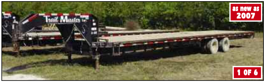
(6) TRAIL MASTER 38' 10-TON T/A GOOSENECK TRAILERS