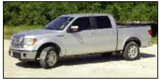
(5) FORD F150 LARIAT PICKUP TRUCKS