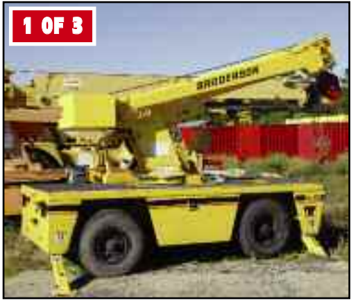
(3) BRODERSON 1C-80-1D 9,500-LB. CARRY DECK CRANES