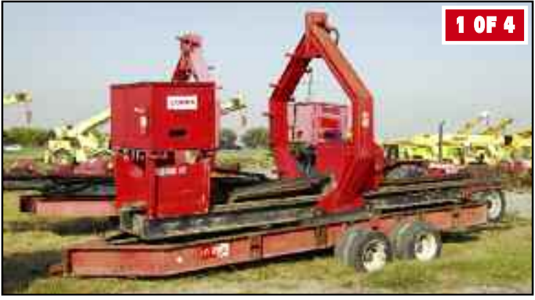
(4) PEINEMANN HYDRAULIC BUNDLE EXTRACTORS