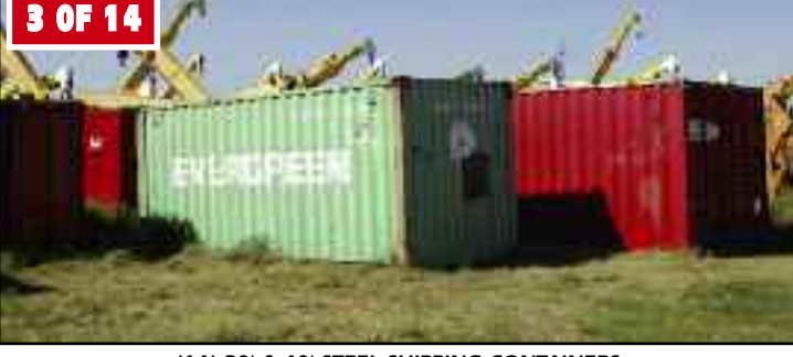
(14) 20' & 40' STEEL SHIPPING CONTAINERS