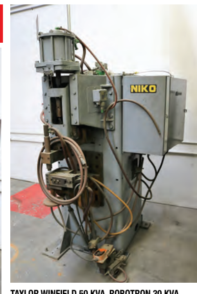
TAYLOR WINFIELD 50 KVA, ROBOTRON 30 KVA, NIKO 50 KVA