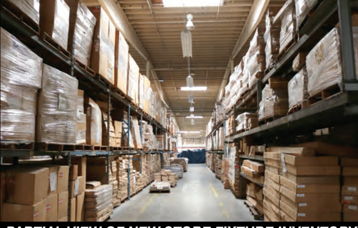
PARTIAL VIEW OF NEW STORE FIXTURE INVENTORY

PRESS BRAKES, SHEARS, BENDING ROLL, PUNCH PRESSES, MACHINE SHOP EQUIPMENT, BRIDGEPORT & ENCO VERTICAL MILLS, WELDING MACHINES & NEW WELDING WIRE, SPOT WELDERS, SHOP SUPPORT ITEMS, STAKE BED TRUCK, FORKLIFTS, STEEL INVENTORY, WAREHOUSE PALLET RACKING, NEW STORE FIXTURE INVENTORY, HARDWARE AND RELATED ITEMS