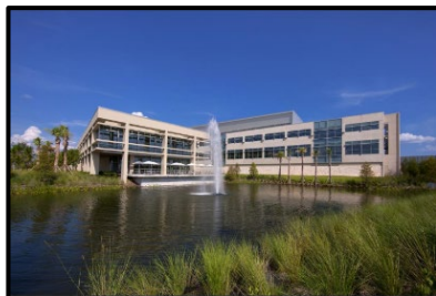
UCF Lake Nona Cancer Center, Health Sciences Campus