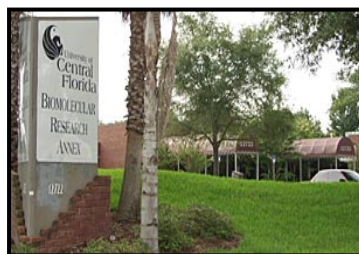
Biomedical Research Annex, Research Park