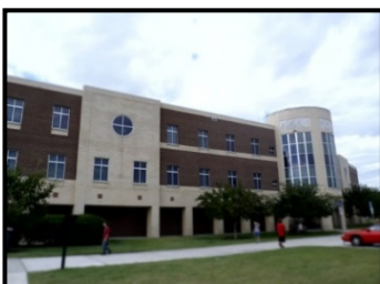
Health & Public Affairs II Building, Main Campus