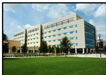
Burnett Biomedical Sciences Building, Health Sciences Campus