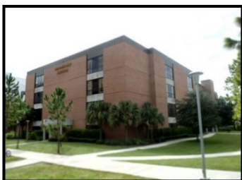
Biomedical Sciences Building, Main Campus

Faculty and staff in the School are located in five areas: The Biomedical Science and Health & Public Affairs II Building on Main Campus, the Biomedical Research Annex in Research Park, the Burnett Biomedical Sciences facility, adjacent to the College of Medicine, and the Lake Nona Cancer Center at the Lake Nona Medical City Campus.