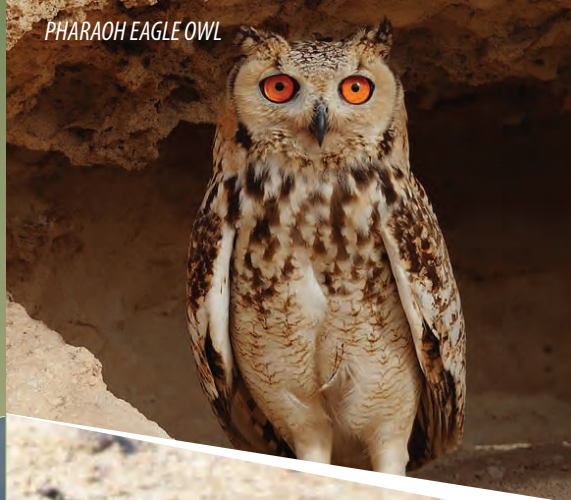
PHARAOH EAGLE OWL