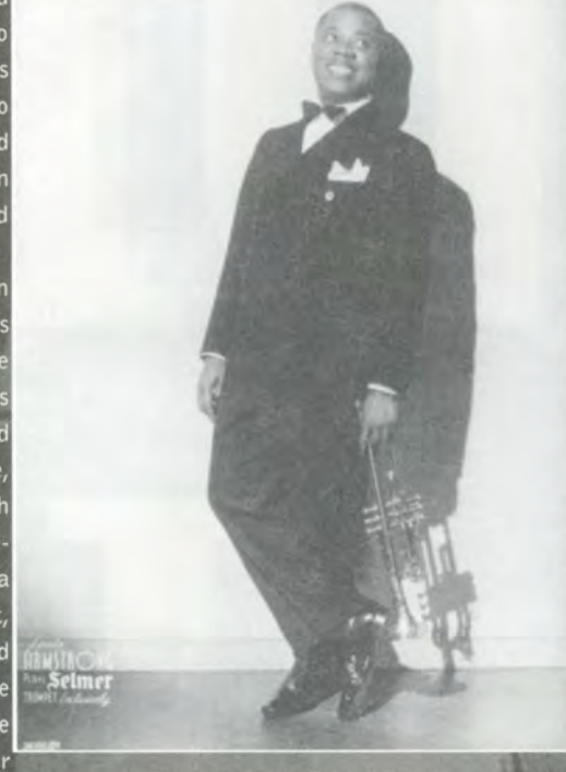
ute of Jazz Studies, Rutgers University

uch representations of black identity, metaphorically denoted by "blackess," have for centuries delighted the imagination of Western thinkers. In Playing in the Dark: Whiteness and the Literary Imagination, Toni Morrison writes that early Euro-Americans meditated upon the modalities of enslaved Africans in order to imagine their democratic nation, a supposedly enlightened sociopolitical body whose founding principles of freedom and liberty would guide the destiny of their new, enlightened civilization. The cultural hegemony of white identity is established in part by American writers who often situated within their prose and poetry an Africanist presence – a character, an event, or onnoted by metaphors of blackness. Literary greats Edgar Allan Poe, ther, Mark Twain, and Ernest Hemingway conjure up images of whiteare "empty," "mute," and "vacuous." This same whiteness, however, the presence of which lynamically transforms when it encounters blackness, the presence of which cites complex dualities that can be both "evil and provocative, rebellious and Harlemites and upper-crust whites who packed the dance floors seven nights a deployed metaphors of blackness – Africanisms, to use Morrison's terminology