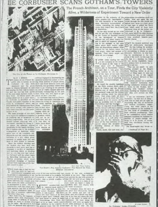
New York Times Magazine, 3 November 1935.

dance halls and nightclubs; it pervades the space of the city where a "vast nocturnal festival . . . spreads out." The dark vertical shafts of the Daily New an unearthly suavity, broken by a blow like a flash of lightning." Clearly in Building, Chrysler Building, McGraw-Hill Building, Rockefeller Center, and admiration of Armstrong's brilliance and artistry, Le Corbusier identifies a the Empire State Building puncture the shadowy corridors of the city grid. As