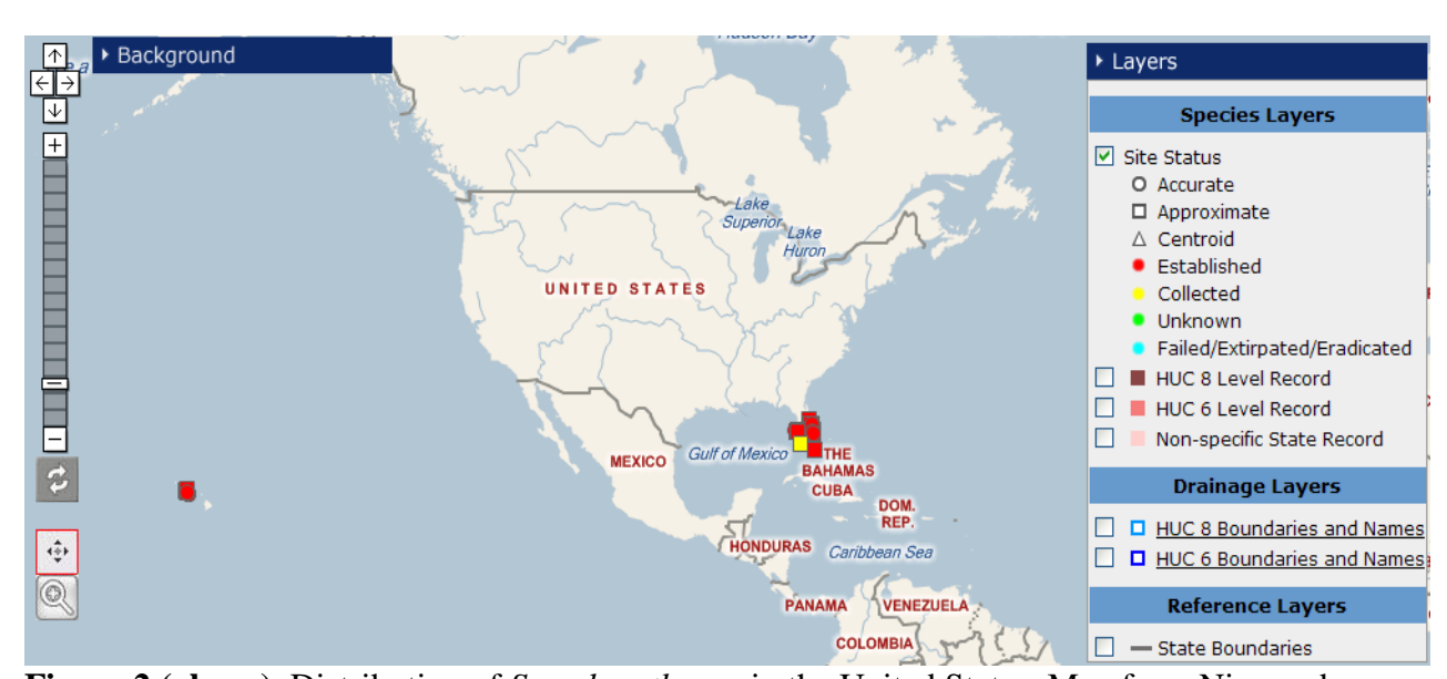
Figure 2 (above). Distribution of S. melanotheron in the United States. Map from Nico and Neilson (2014).