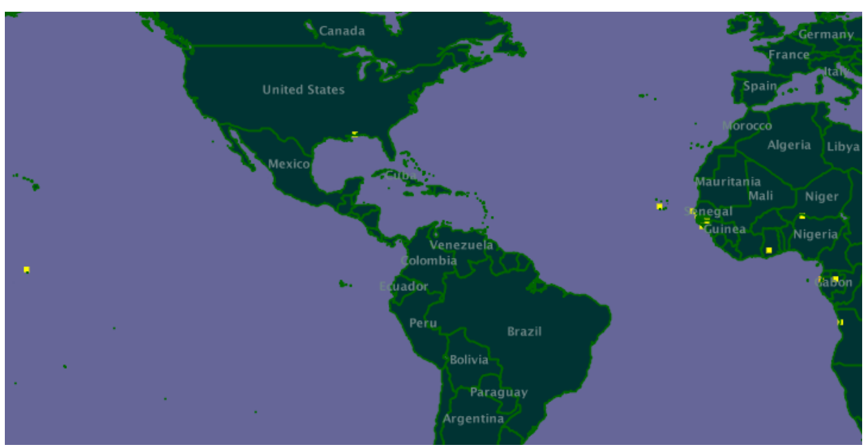
Figure 1 (above). Global distribution of S. melanotheron . Map from GBIF (2010).