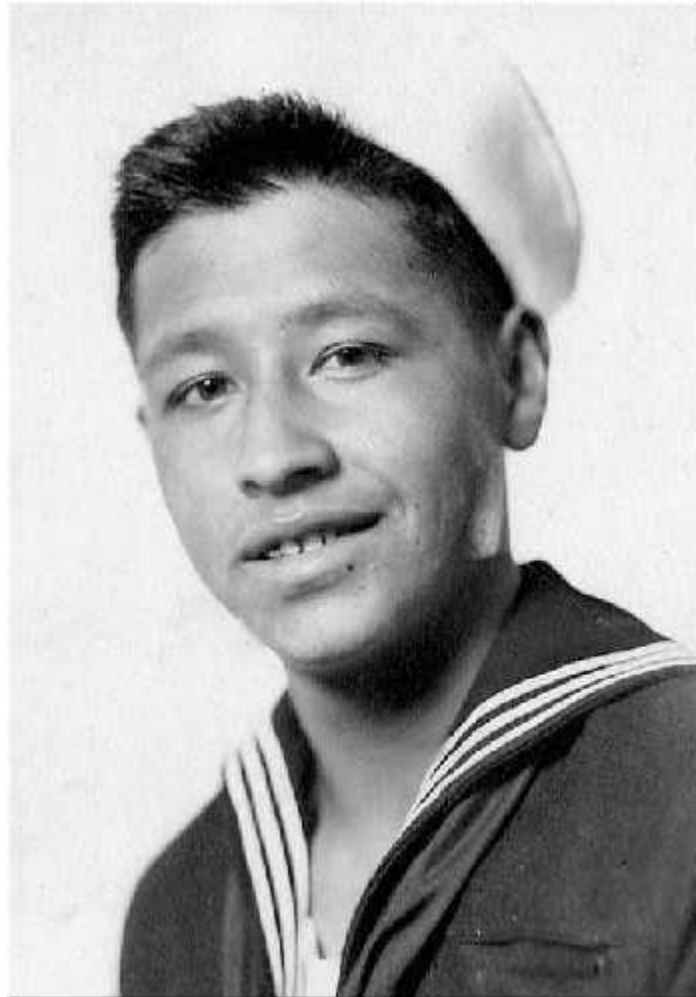
César in his U.S. Navy uniform.

The people César helped often wanted to give him a little bit of money to pay for gas and for his help. César never took any of their money because his mother would have been mad at him. She used to say, "You always have to help the needy, and God will help you."