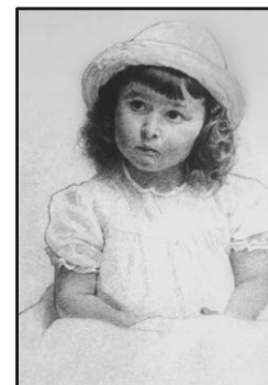
Lady Bird at Age Five