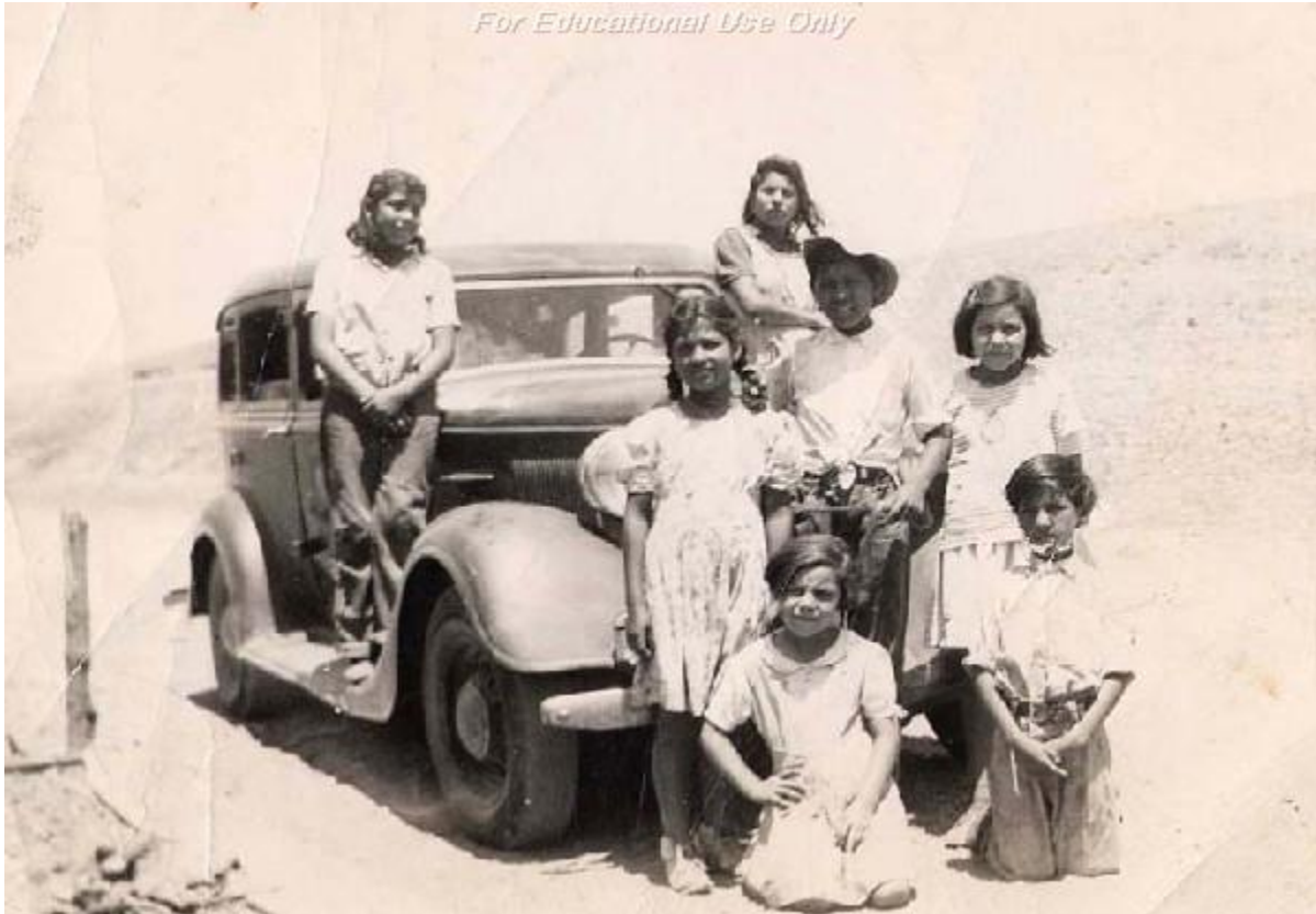
César and his brothers and sisters in front of the family car

César's family moved often. Moving did not bother César, or his sisters and brothers too much because their parents loved them and because they were always happy to be together as a family.