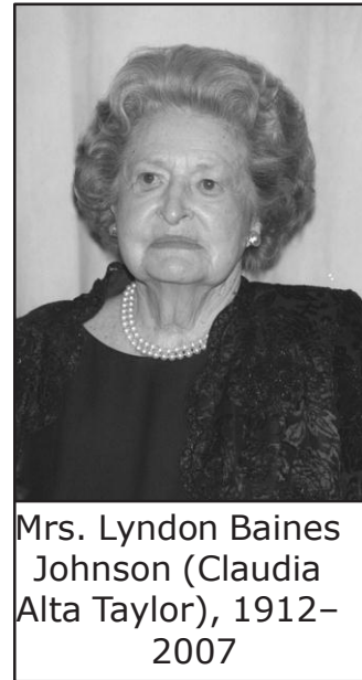
Mrs. Lyndon Baines Johnson (Claudia Alta Taylor), 1912– 2007