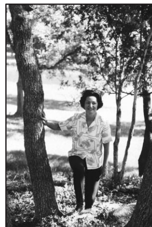
Lady Bird enjoys nature in January 1965