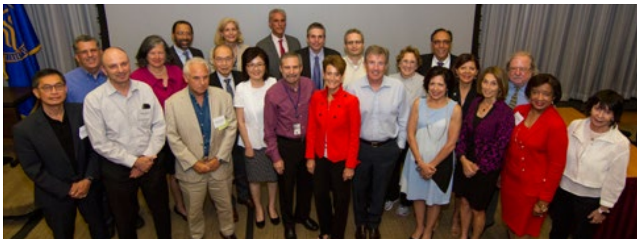
Participants at a Blue Ribbon Panel meeting in July 2016

Principal Deputy Director, National Institutes of Health