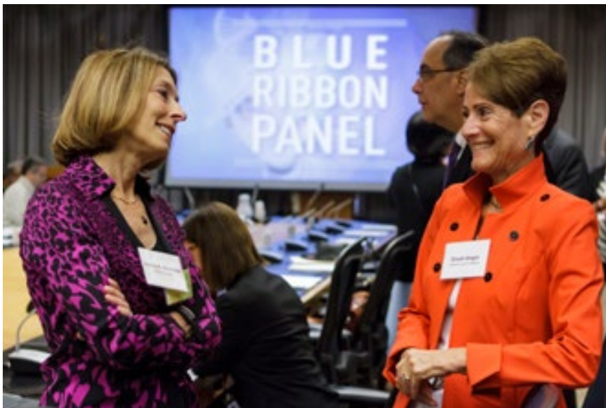
Laurie Glimcher and Dinah Singer at a Blue Ribbon Panel meeting

Implementation of the National Cancer Data Ecosystem has the potential to transform our collective understanding of cancer through the availability of shared patient information and other data derived from diverse cancer research efforts. Encouraged by the Cancer Moonshot, this national cancer information infrastructure will connect currently siloed data sources and serve as the foundation for developing powerful new integrative analyses, visualization methods, and portals that will not only enable new insights into cancer initiation, progression, and metastasis, but also inform new cancer treatments and help initiate new clinical trials. The National Cancer Data Ecosystem is expected to improve the overall quality of care for cancer patients and encourage individuals to directly participate in and derive immediate value from their interactions and contributions. It will provide patients, including those from racial/ethnic minority groups and other underserved populations, with useful knowledge, community, and options as they move through their cancer journey. Over time, the National Cancer Data Ecosystem will vastly improve the efficiency and effectiveness of the nation's cancer research efforts by bringing powerful computational methods and vast amounts of data in an organized fashion in order to enable progress in cancer treatment and prevention.