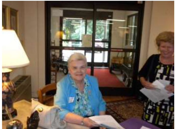
We caught last year's President coming to register!