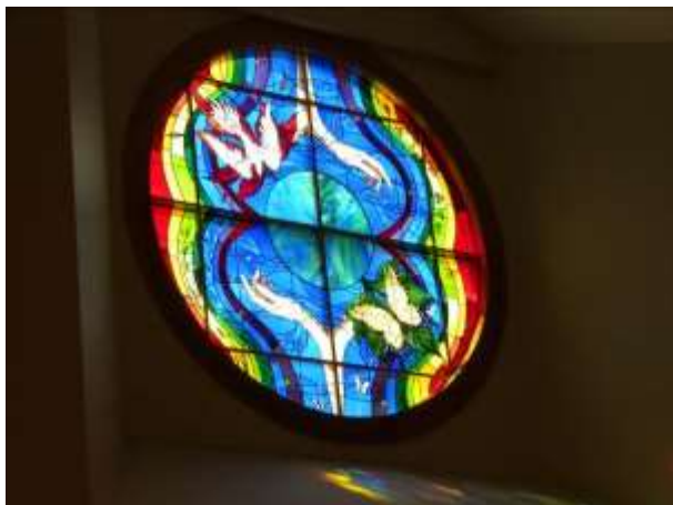
Stained glass window in the Chapel at the Brooks-Howell Home