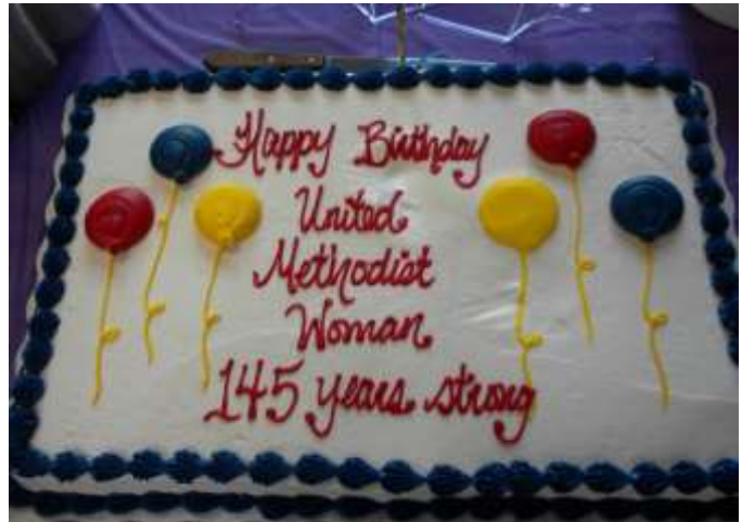
Happy Birthday UMW!