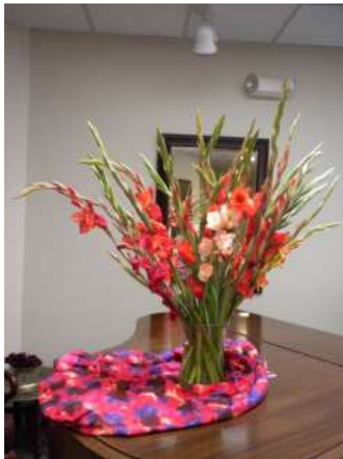
Hope you can print this in color! Brooks-Howell was beautifully decorated!