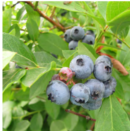
'Rubel' (northern highbush)