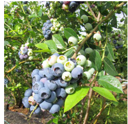
'Reka' (northern highbush)

This publication replaces OSU Extension publication EC 1308, Blueberry Cultivars for Oregon .