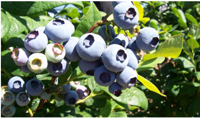
'Draper' (northern highbush)