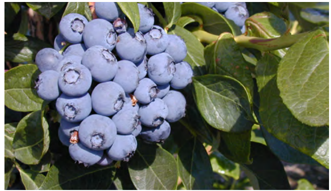
'Duke' (northern highbush)