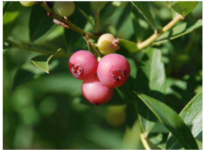
‘Pink Lemonade’ (rabbiteye)

Of the early-season cultivars, ‘Duke’ and ‘Spartan’ tend to bloom later than average. Late-season