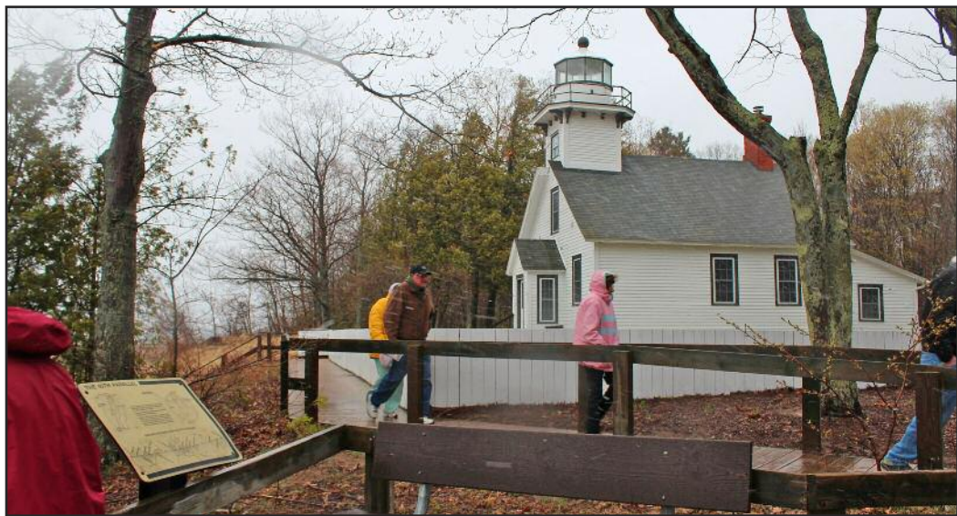
Tour members visit the Old Mission Point Lighthouse, located on the 45th parallel.

We are delighted to have enabled more of our members to experience a Michiana Chapter outing. Our goal was to try to reach into an under served part of our membership area and provide an opportunity for some of our members that can't make it to the events that are held in Grand Rapids, Kalamazoo, or South Bend.