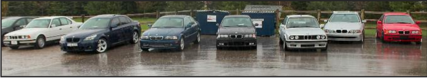
Blackstar Winery's lot, filled with our Michiana Bimmers.

“ In true Michigan spirit, we had now enjoyed every kind of weather ... ”