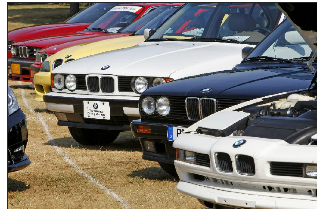
Celebrating its second year on July 13, DeutscheMarques is an all-German car show at the world-class Gilmore Car Museum in Hickory Corners. Michiana members created this event as a fun way to meet fellow German car enthusiasts and enjoy an afternoon at the Gilmore Car Museum.

Every Month 1st Wednesday, Social Get Together meetings, 6:30 p.m. Kalamazoo area: (May-Sept) Gilmore Car Museum's Cruise Nights, 6865 Hickory Road, Hickory Corners, Michigan. Grand Rapids area: Ucellos, 10 Rivertown Parkway, Grandville, Michigan.