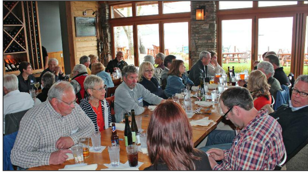
The Apache Trout Grill featured an excellent meal and Grand Traverse Bay views.