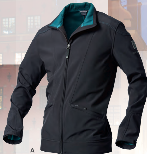
A. Urban soft-shell jacket, men's Polyester-elastane mix, Caviar. S-XXXL 76 61 8 532 859 – 864 $159.00