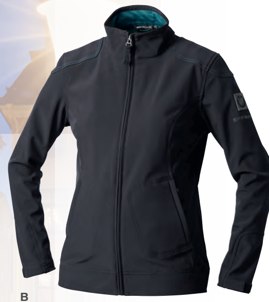
B. Urban soft-shell jacket, ladies' Polyester-elastane mix, Caviar. XS-XL 76 62 8 532 750 – 754 $149.00