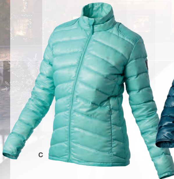
C. Urban ladies' down jacket Polyamide, down filling, Blue. XS-XL 76 62 8 532 756 – 760 $219.00