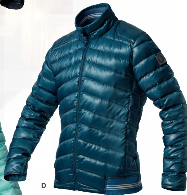
D. Urban men's down jacket Polyamide, down filling, Blue. S-XXXL 76 61 8 532 894 – 899 $245.00