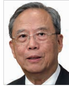
H.E. ZENG Peiyan Vice Chairman Former Vice Premier of China