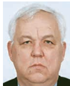
H.E. Sergey TERECHSHENKO Member of the Council of Advisors Former Prime Minister of Kazakhstan