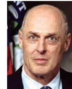
Mr. Henry PAULSON Board Member Former Secretary of the Treasury (USA)