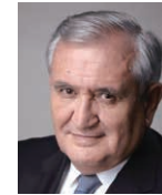
H.E. Jean-Pierre RAFFARIN Board Member Former Prime Minister of France