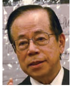
H.E. Yasuo FUKUDA Chairman Former Prime Minister of Japan