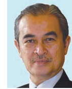
H.E. Abdullah Ahmad BADAWI Board Member Former Prime Minister of Malaysia