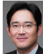
Mr. Jay Y. LEE Board Member Vice Chairman of the Samsung Group (Korea)