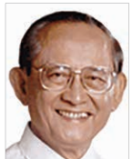
H.E. Fidel V. RAMOS Chairman of the Council of Advisors Former President of the Philippines