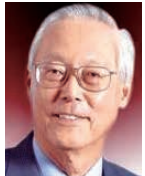
H.E. GOH Chok Tong Board Member Emeritus Senior Minister of Singapore