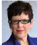
H.E. Jenny SHIPLEY Board Member Former Prime Minister of New Zealand