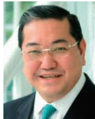
H.E. SURAKIART Sathirathai Board Member Former Deputy Prime Minister of Thailand