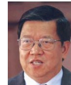
Mr. LONG Yongtu Member of the Council of Advisors Former Vice Minister of MOFTEC (China)