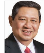
H.E. Susilo Bambang YUDHOYONO Board Member Former President of Indonesia