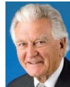
H.E. Bob HAWKE Member of the Council of Advisors Former Prime Minister of Australia