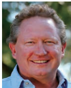
Mr. Andrew FORREST Member of the Council of Advisors Chairman of the Fortescue Metals Group (Australia)