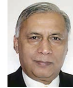
H.E. Shaukat AZIZ Board Member Former Prime Minister of Pakistan