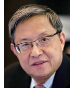
Mr. ZHOU Wenzhong Secretary General Former Deputy Minister of Foreign Affairs Former Ambassador to United States of China