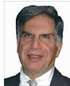
Mr. Ratan N. TATA Board Member Chairman Emeritus of Tata & Sons (India)