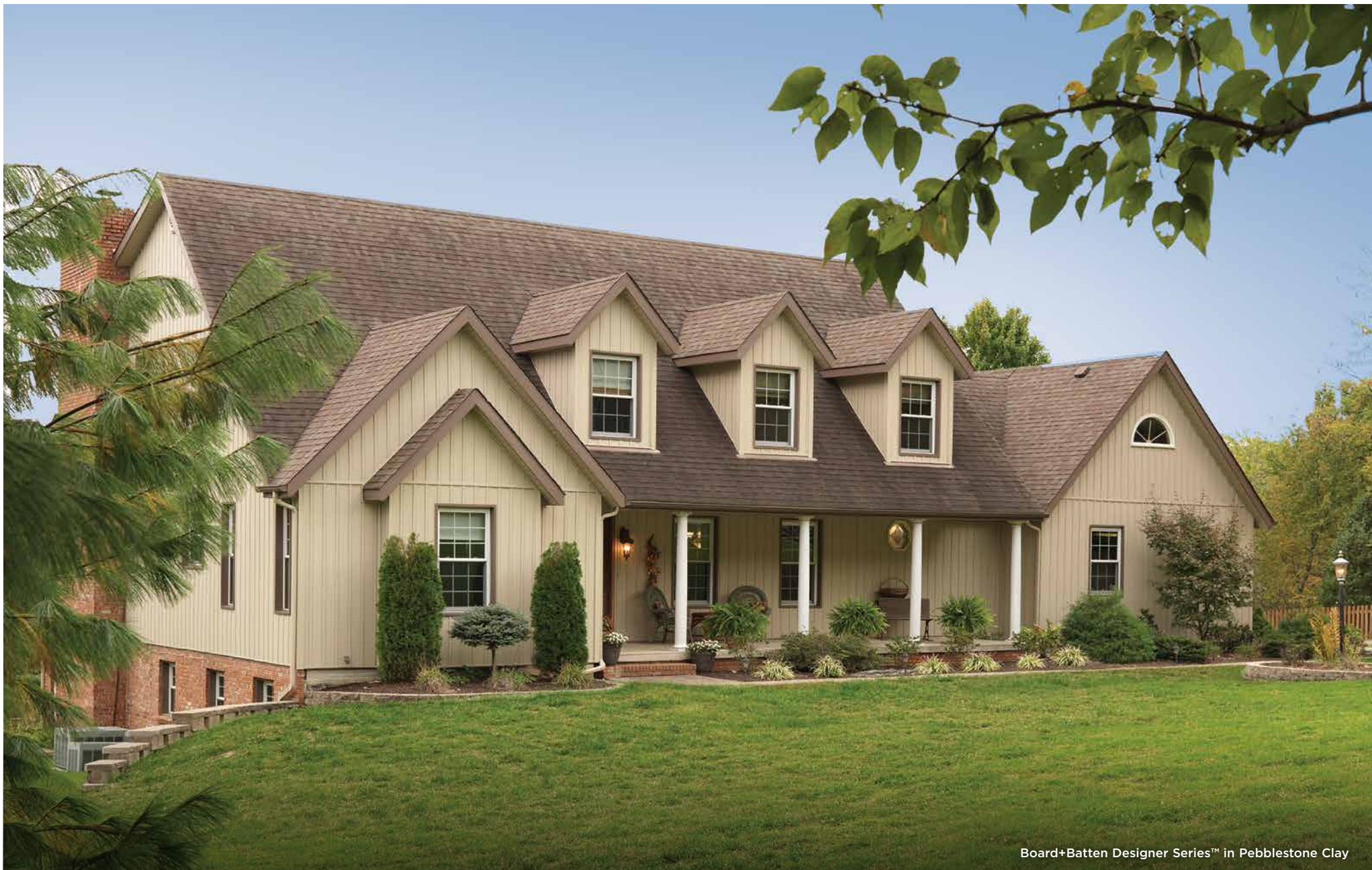
Board+Batten Designer Series™ in Pebblestone Clay

Board+Batten Designer Series™ delivers striking style in a vertical panel. Use it as the dominant exterior cladding or as an accent to highlight architectural features. Available in a broad range of colors, including new darker hues for a contemporary look, it never needs painting. Advanced engineering ensures superior impact resistance and outstanding durability in all weather conditions.