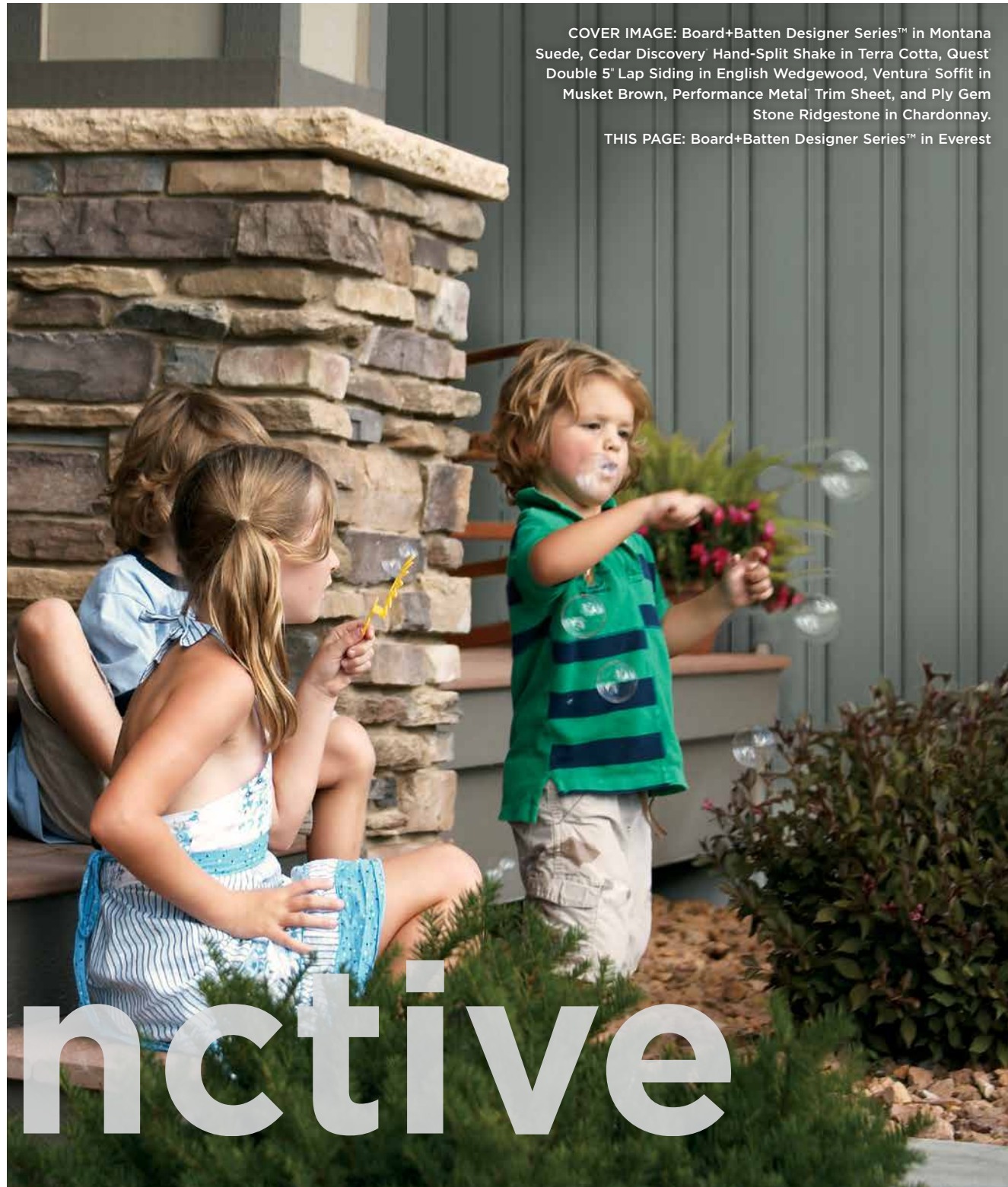
COVER IMAGE: Board+Batten Designer Series™ in Montana Suede, Cedar Discovery Hand-Split Shake in Terra Cotta, Quest Double 5" Lap Siding in English Wedgewood, Ventura Soffit in Musket Brown, Performance Metal Trim Sheet, and Ply Gem Stone Ridgestone in Chardonnay.

Dream big on your new home or remodeling project—with Mastic.