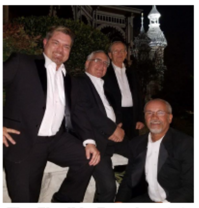
The Flexible Four Quartet of the: