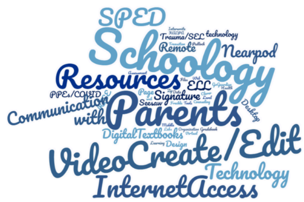
PROFESSIONAL DEVELOPMENT/ OTHER NEEDS