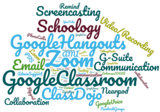
WHAT WORKED WELL

On the April 13 scheduled Professional Development day in recognition of the tremendous amount of work the emergency remote teaching situation thrust upon teachers & staff, no activities were scheduled. Instead we conducted a brief survey to get ideas on what was working well and what areas we might need to focus on for future training and PD. We compiled the results of over 1000 responses and common themes, highlighted in the wordclouds, emerged. This feedback was extremely valuable and we are working to incorporate the tools and concepts that worked as we seek to meet the identified areas of need through our 2020-21 PD opportunities.