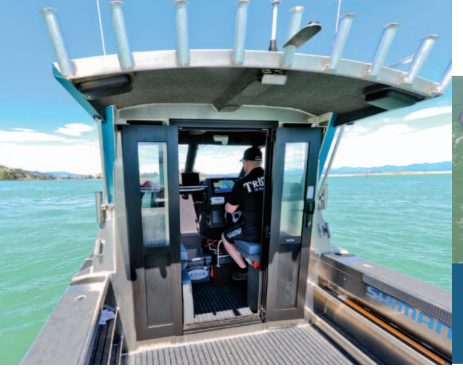
Defiant's bait station is a custom affair built by a friend. It features a decent bait/filleting board that drains overboard, plenty of sinker/cup holders, an array of rodholders across the back and a shelf underneath. The hardtop has a useful rocket launcher and there are six through-gunwale rodholders, plus stowage space in the full length side pockets.

lights, red and white LED cabin lights by Hella and cockpit floodlights as well.