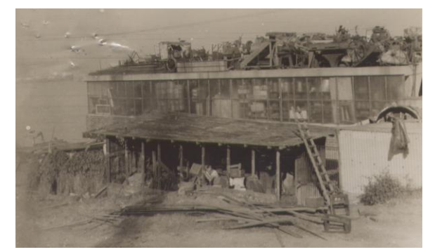
The progress association also complained that the "premises are the breeding places of rats and other forms of vermin". This could well be justified in this 1959 view of the site.

This site was the subject of numerous complaints over many years from residents. The McMahons Point Lavender Bay Progress Association was the most vocal opponent, complaining of the "indescribably untidy appearance of the company's land and buildings" despoiling the beauty of the harbour foreshores.