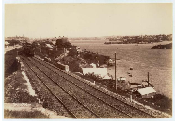
North Shore railway line above Berrys Bay, c.1893.

The North Shore line was extended from St Leonards to the ferry wharf/tram terminus at Milsons Point in 1893. The railway bridge and line here is part of the original railway line which operated before the construction of the Sydney Harbour Bridge in 1932. The railway line was diverted after Waverton Station via a tunnel below Bank/Ancrum/Euroka Streets to new stations at North Sydney and Milsons Point. This former railway line services the stabling yards behind Luna Park in Lavender Bay.