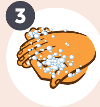
3 RUB VIGOROUSLY for 15 seconds