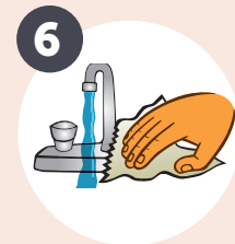
6 TURN OFF WATER with paper towel