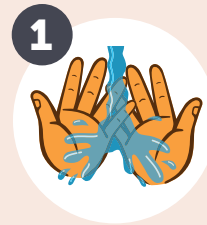
1 WET HANDS with warm water