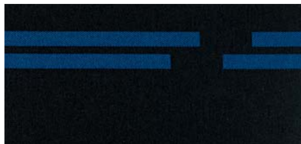
248 black/blue Strike