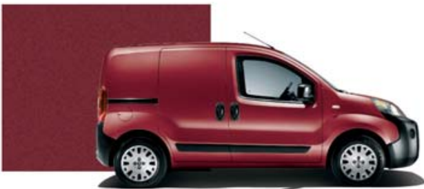
293 Dark Red