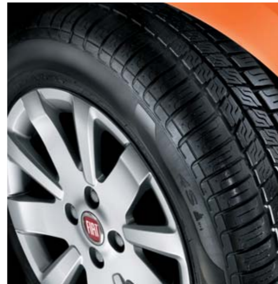
15" wheels and all-season M+S tyres for use over any terrain and in all weather conditions.

The Adventure Pack , which is available also for the other Fiorino versions, includes front bumpers with chrome protection, higher side protections, under-engine protection, heightened suspension and special 15" tyres.