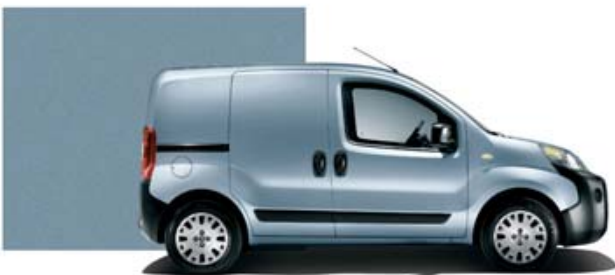
448 Light Blue