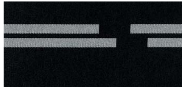
298 black/grey Strike