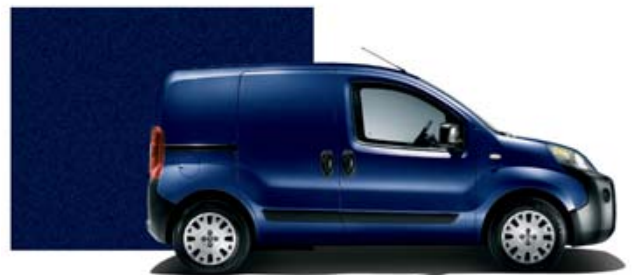
487 Dark Blue