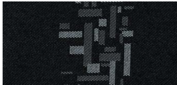
196 black Tangram