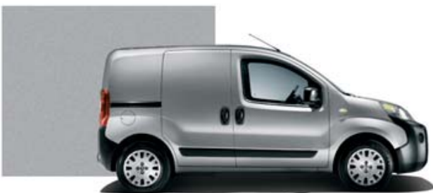
612 Light Grey