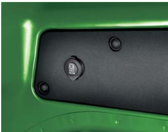
12 V socket in load compartment.