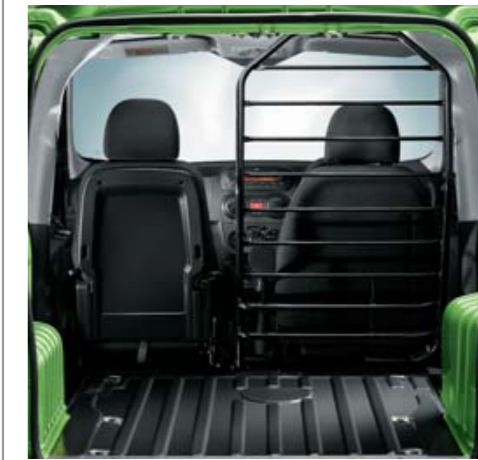
Metallic tubular ladder for driver protection.