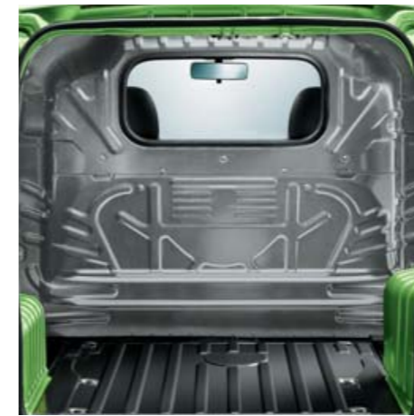
Glazed load compartment partition.