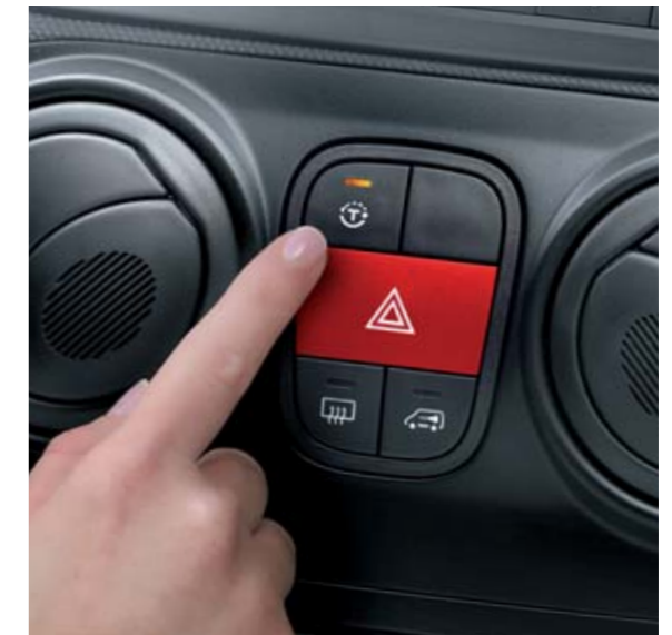
Traction+ for optimised traction during low-speed acceleration.