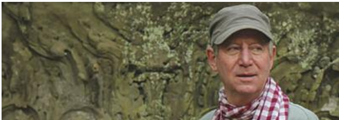
Régis Wargnier: Stories in which love triumphs over politics.