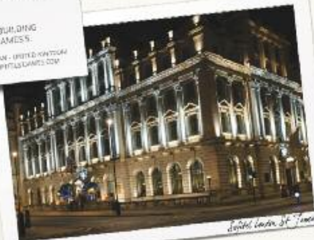
Sofitel London St James