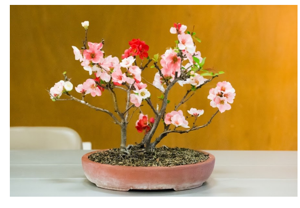
Quoc's Japanese Quince (above)