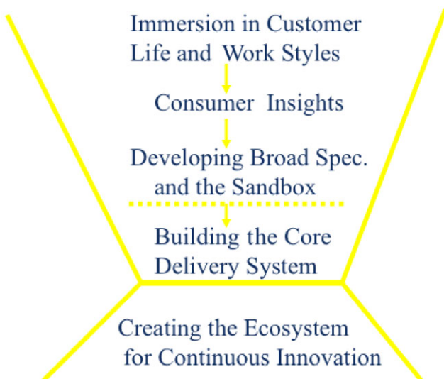
Figure 2. The Process for Developing Business Specifications

The implications of these constraints are important to recognize. The product design had to fulfill its functional characteristics—smoke-free and energy efficient. It also had to be esthetic and beautiful. Functional and emotional appeal was built into the design. The product had to be aspirational. Second, the safety standards had to be global standards , not local standards. Actually, India did not have government-imposed standard for biomass stoves. This was a critical constraint. So much of the work at BOP focuses not just on local solutions but local standards . We wanted to ensure that the poor get the best