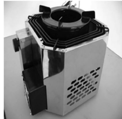
Figure 4. The Evolution of Product Concepts and Configurations

potential buyers of the stoves as well as stock the stoves and fuel. They were an indispensable part of the logistics system for making stoves accessible and fuel available all the time. They were also the key to create an awareness of how the new stove worked. Collaboration with NGOs, and with their help in building a village-level entrepreneurial network, was critical (Brugmann and Prahalad, 2007).