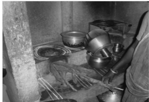
Figure 1. Traditional Cooking System in Rural India

The constraints within which we had to operate—the innovation sandbox—became obvious. We had to: