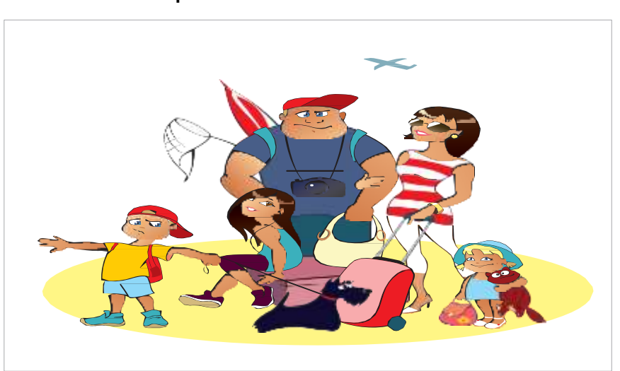
1. One of my favorite memories is of my family on vacation at the beach five years ago. We went swimming. We took lots of photos. We even brought our dog along. This photo reminds me of one of the happiest times of my life. When I look at it I always laugh.

Look at the pictures below and write a few sentences to tell a story.