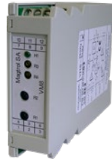
Model VM8 Proportional Amplifier/Controller

The VM Series Proportional Amplifier/Controller is used to supply and control current (up to 3 A) to Magtrol Hysteresis Brakes and Clutches and Convection Powder Brakes.