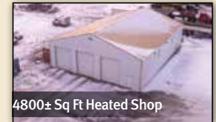
4800± Sq Ft Heated Shop