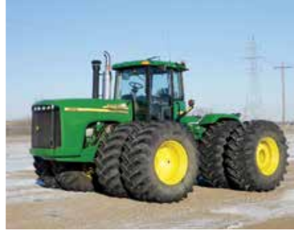
2003 John Deere 9520