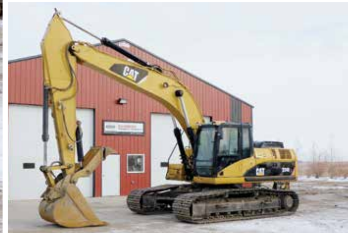
2009 Caterpillar 324DL