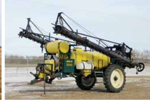
2001 Spray-Air 3200 80 Ft