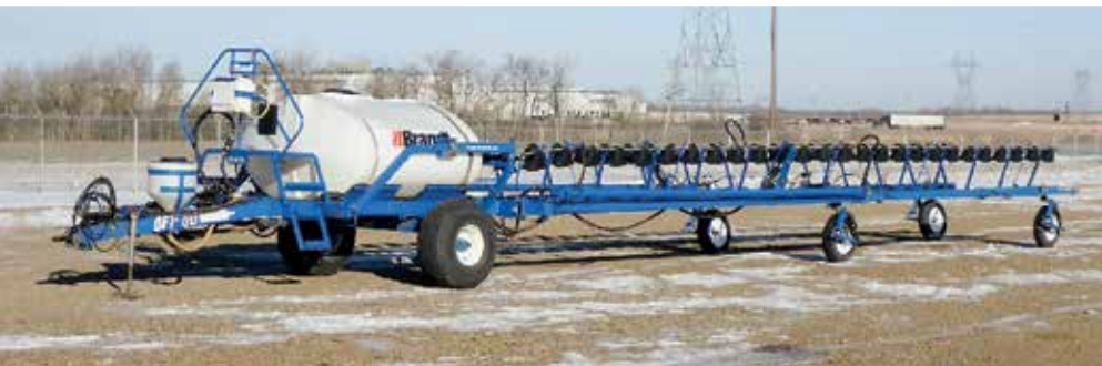
2006 Brandt QF1500 90 Ft