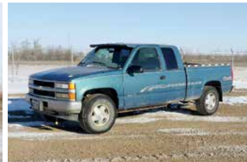
1998 Chevrolet 1500 4x4