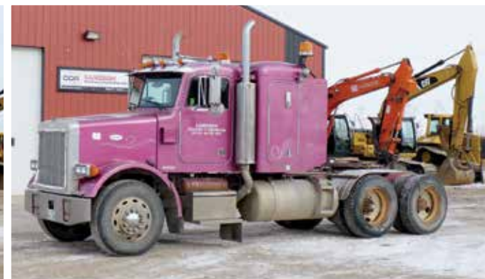
1995 Peterbilt 378