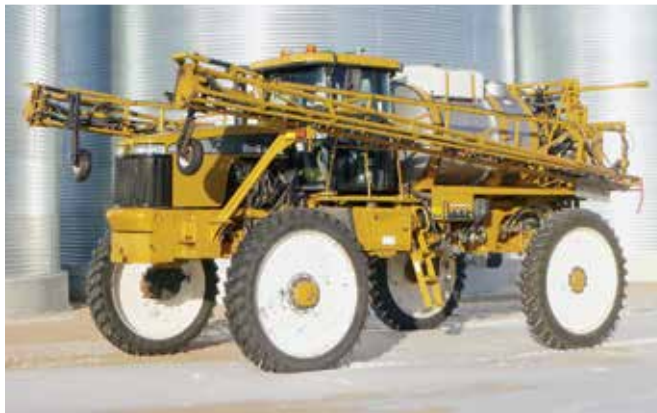
2004 Rogator 1264 108 Ft