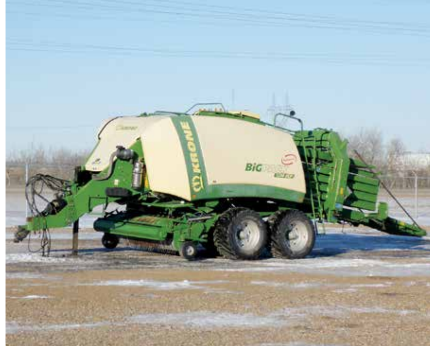
2012 Krone BP1290HDP