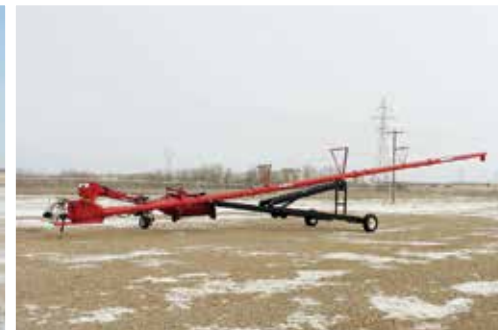
2014 Wheatheart X100-83