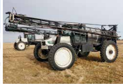
Willmar 8400 120 Ft