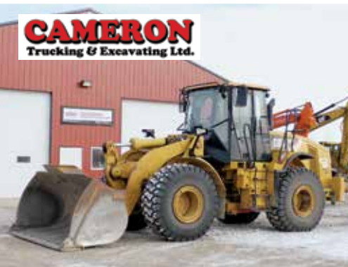
2011 Caterpillar 950H