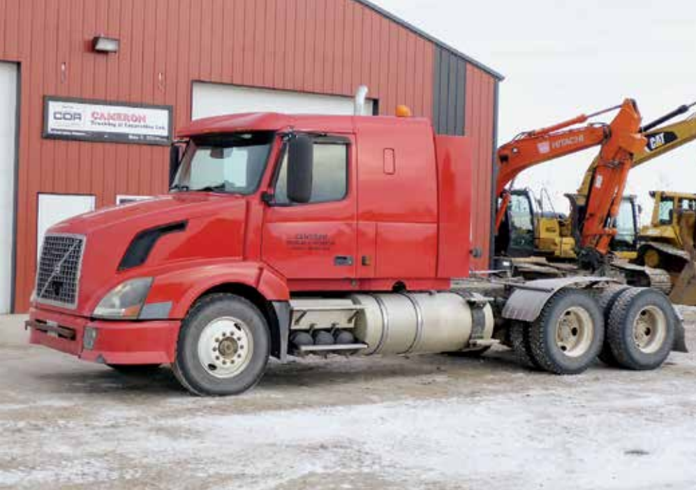
2005 Volvo VNL