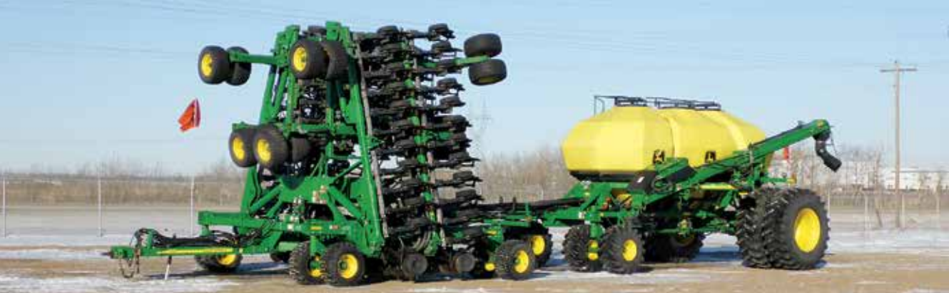
2015 John Deere 1890 60 Ft w/1910 550 +/- Bu