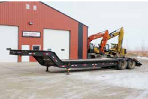
1964 Columbia 38 Ft