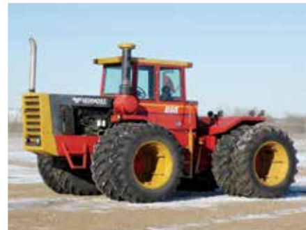
1984 Versatile 895 Series III