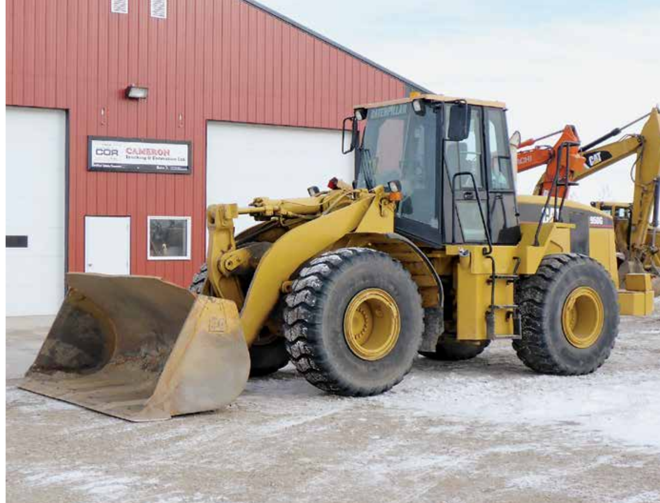
2001 Caterpillar 950G