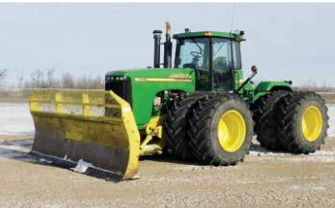
2003 John Deere 9220 & 2008 Degelman 7900 16 Ft