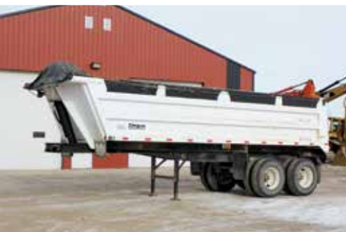
2012 Loadline 24 Ft