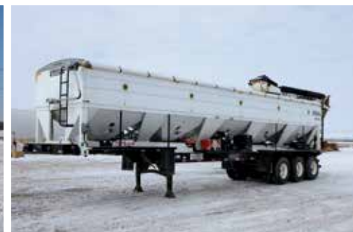
2010 Convey-All CST-40C 40 Ft