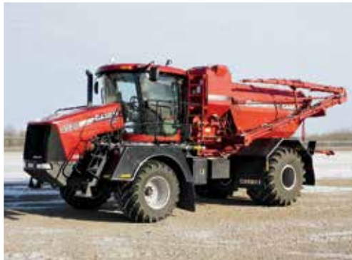
2014 Case IH Titan 4530 70 Ft