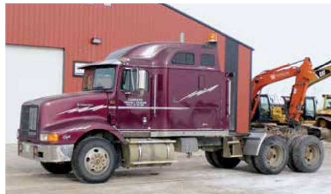
1996 International 9200 Eagle