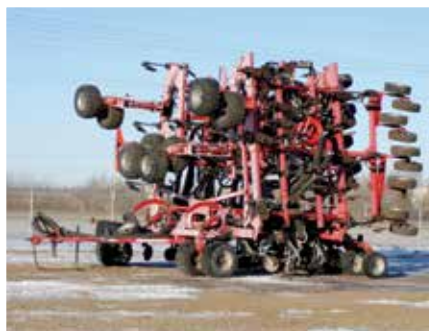
2008 Horsch 60-15 60 Ft