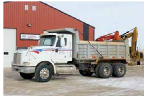
2007 International 9400I