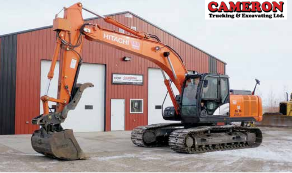
2015 Hitachi ZX210LC-5N