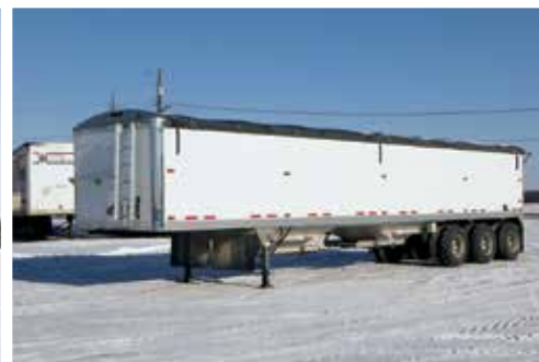
2012 Timpte 45 Ft