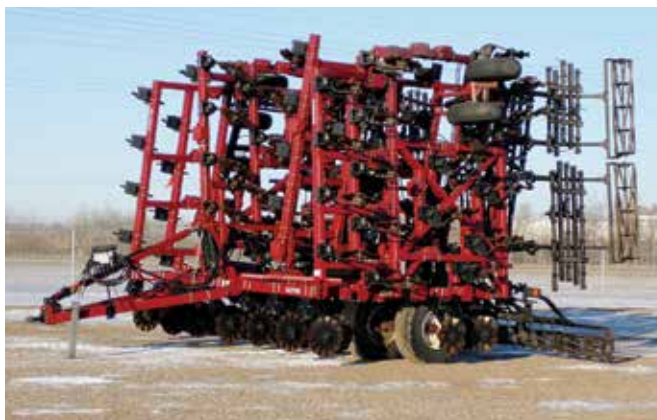
2012 Salford 570HD 60 Ft

» See complete and up-to-date listings for this auction at rbauction.com