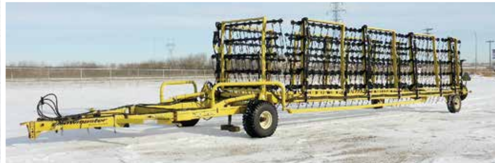
2007 Degelman SM7000 82 Ft