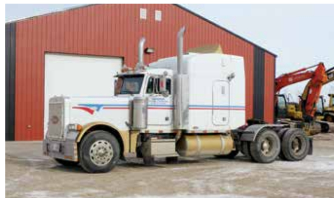
1995 Peterbilt 379