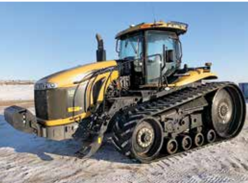
2009 Challenger MT85C