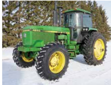
1986 John Deere 4850