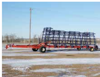
2000 Morris 70HHB 70 Ft