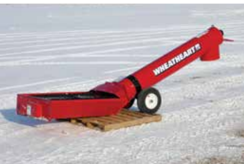
1 of 6 - Unused - Wheatheart