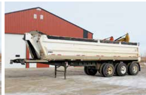
2006 Arnes 30 Ft