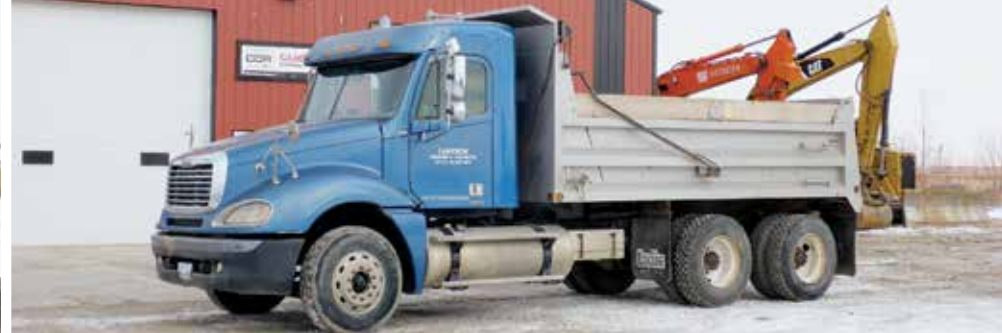
2004 Freightliner CL120 Columbia