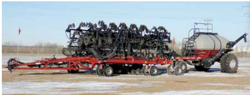
2010 Case IH 700 60 Ft & 2010 Case IH 3430 430 +/- Bu