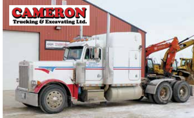
2000 Peterbilt 379