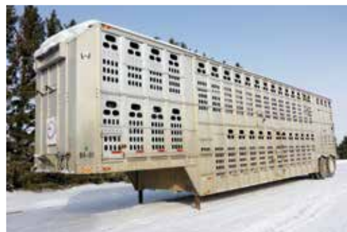
1994 Barrett 48 Ft