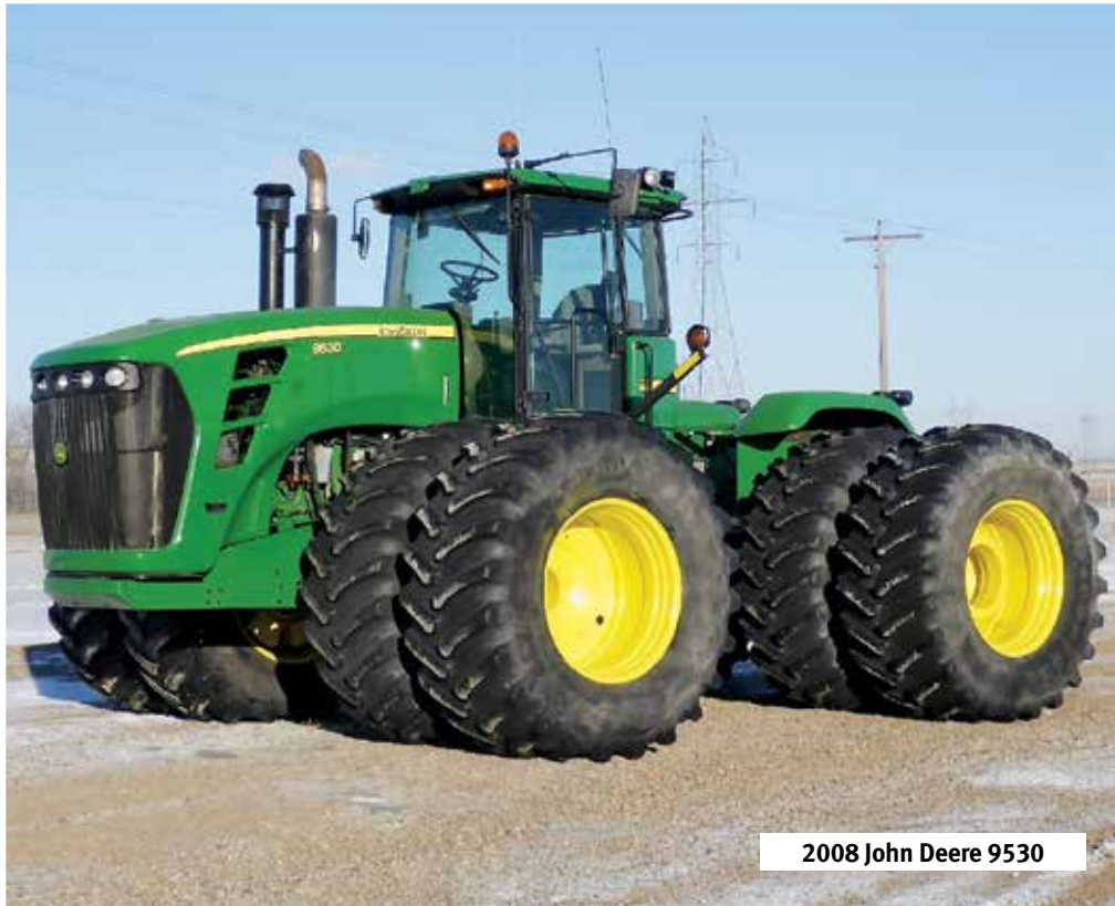
2008 John Deere 9530