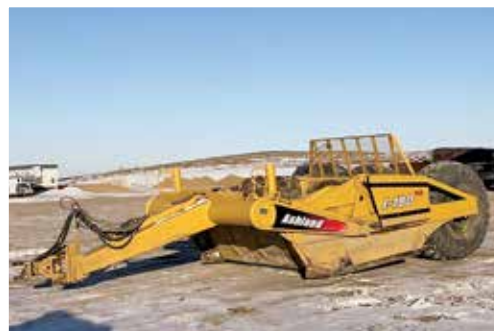
2007 Ashland I180TS2 18 Cu Yd