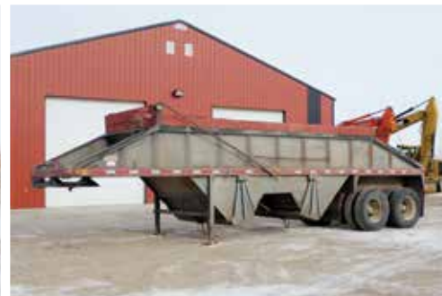
1986 Decap 32 Ft