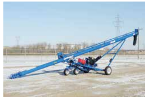
2017 Brandt 1042