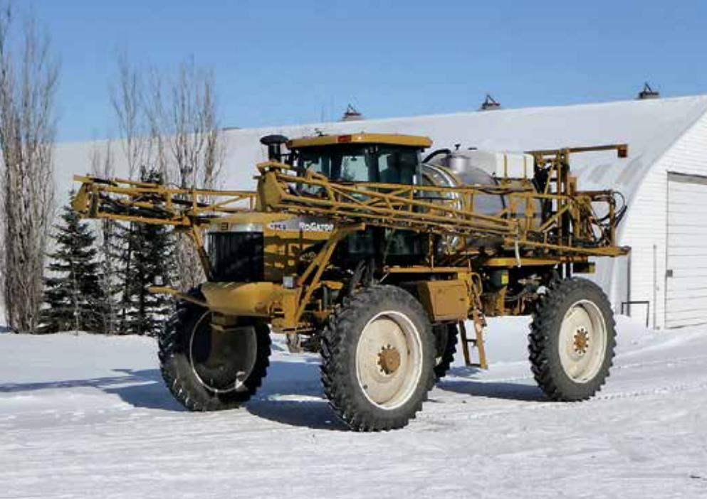
2002 Rogator 1254 90 Ft