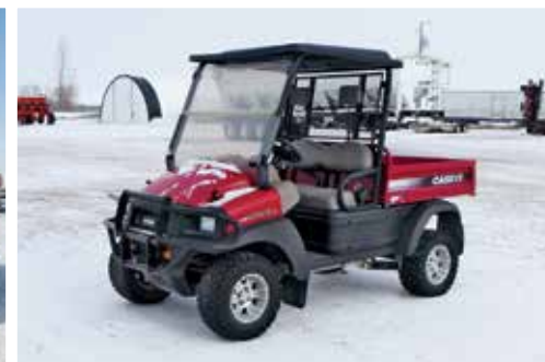
2013 Case IH Scout XL