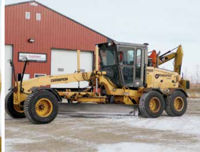
1999 Champion 740A Series V