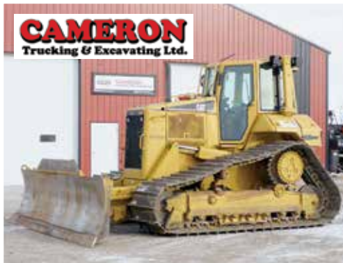
2006 Caterpillar D6N LGP