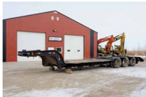
2008 Custombuilt 42 Ft