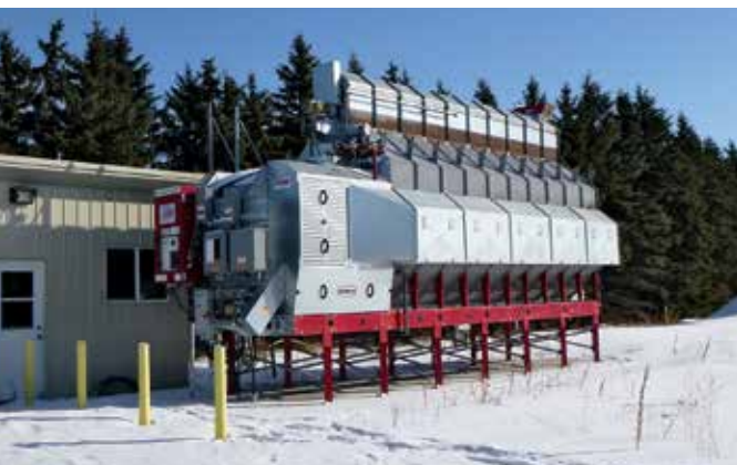
2013 Super B SQ20A 590 BPH