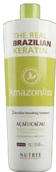
AL-002 AMAZONliss Brazilian Smoothing Treatment 1 litre