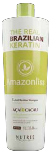
AL-001 AMAZONliss Anti Residue Shampoo 1 litre