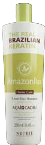
AL-004 AMAZONliss Anti Frizz Shampoo 250ml

The Intensive Repair Mask provides maximum hydration and softness to the hair, creating and enhancing the smooth effect.