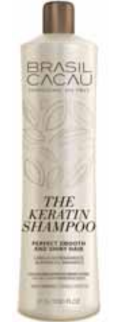
BRASIL CACAU KERATIN SHAMPOO 1 litre 12601

*Perform a strand test prior to use: Apply product, leave it for 30 minutes, rinse, dry and flat iron. Evaluate the elasticity and strength of the hair shaft. SHAKE BEFORE USE.