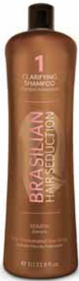
Step 1: Brazilian Hair Seduction Clarifying Shampoo 1L P951

Professional Kit 1ltr x 3 (3 bottles: Step 1, 2 & 3) P950