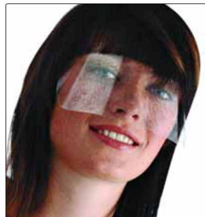
Disposable visor for treatments & cutting, 30/pkt 6041

BRASIL CACAU's aftercare products ensure long lasting results, up to 3 to 4 months.