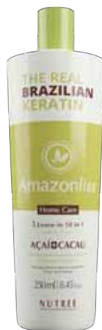
AL-006 AMAZONliss Leave in 10in1 250ml