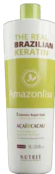
AL-003 AMAZONliss Intensive Repair Mask 1 litre