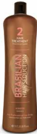
Step 2: Brazilian Hair Seduction Hair Treatment 1L 13360