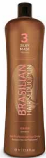
Step 3: Brazilian Hair Seduction Silky Mask 1L P952