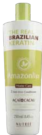
AL-005 AMAZONliss Anti Frizz Conditioner 250ml