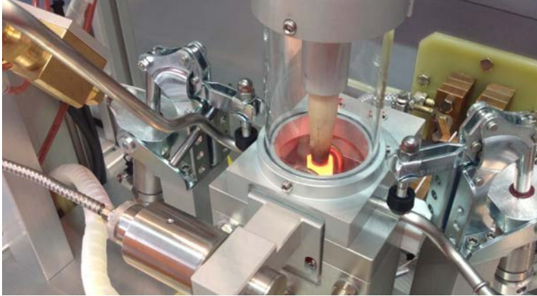
Gas-shielded induction brazing by using Nitrogen; alloyed steel tube construction, Brazing alloy A 200 L

Zn and Cd free brazing alloys for example A 200L; A 205 are suitable for gas-shielded induction brazing.