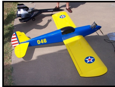
R/C demo included an SR-71!