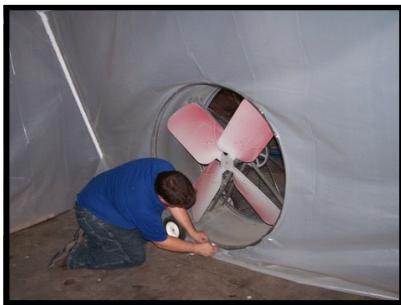
A large fan provides ventilation.