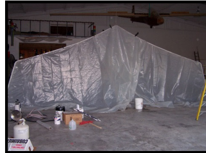
Overlapping tarps give access but keep the dirt out.