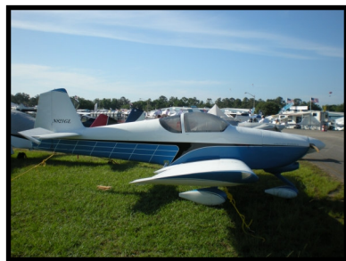
First trip was to Sun N' Fun where he claimed the "Best Alternative Engine" award.