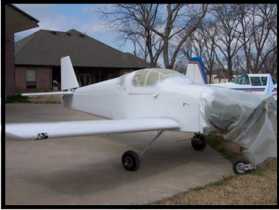
Base coat of white followed by Jason & Gwen's custom designed hatch work.