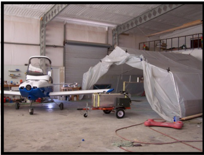
Rollout for the final touches. Looks good!