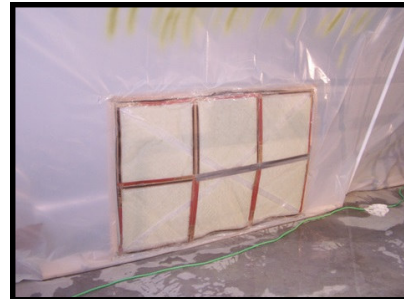
Air filter rack on opposite side.