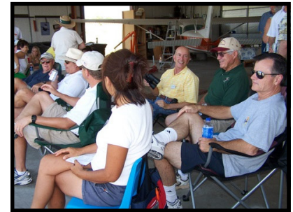
Perfect - short meeting, food, and lots of talking.