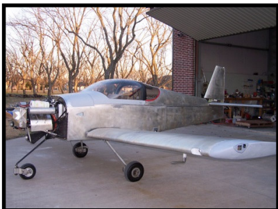
All cleaned up and ready to shoot