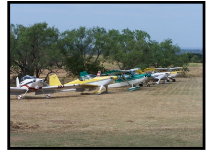
Matlock International Airport