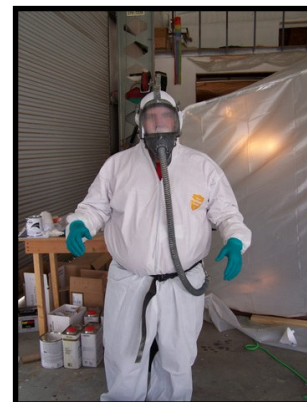
Let's do it!