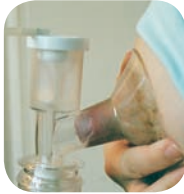
Left Photo: Good Fit