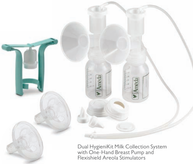
Dual HygieniKit Milk Collection System with One-Hand Breast Pump and Flexishield Areola Stimulators

All Ameda Hospital-Grade Breast Pumps are part of a 2 part system which requires the use of an Ameda HygieniKit Milk Collection System for effectiveness and safety when pumping.