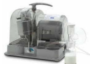
SMB Electric Breast Pump

Please call 1.866.99.AMEDA for additional information on our rental program.