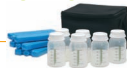
Cool 'N Carry Tote