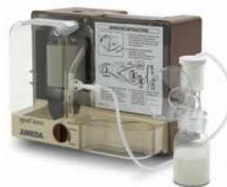
Lact-e Electric Breast Pump