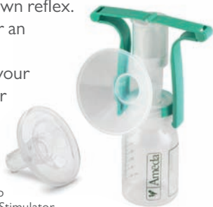
One-Hand Breast Pump with Flexishield Areola Stimulator