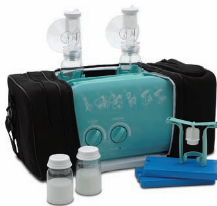
Elite Electric Breast Pump and Elite Pump Rental Kit (Elite available separately)