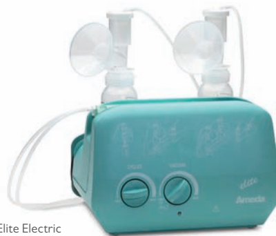
Elite Electric Breast Pump