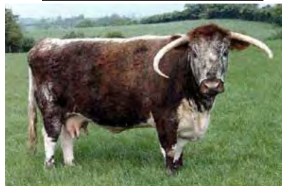
provided by Alan Cheese