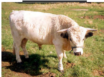
Provided by Baylham House