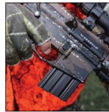
FORGED TRIGGER GUARD