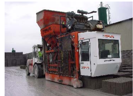
Figure 5: An egg layer block machine

Most modern block making plants in the UK are highly automated and the block making machine is stationary. Earth-dry concrete is fed to the mould where it is vibro-compacted onto steel, timber or plastic pallets. The blocks are de-moulded immediately and transported on a pallet by conveyor to the curing chambers where they may be treated either with heated air or steam to accelerate strength increase. After curing the blocks are taken from the chambers and automatically stacked for delivery. To preserve their appearance, blocks to be used for facing work may be shrink-wrapped in polythene. Figure 6 shows blocks on delivery.