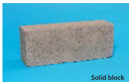
Figure 4: Types of block

Figure 4 shows these three types of block