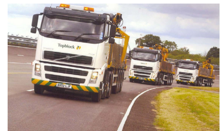
Figure 6: A delivery of blocks

Concrete blocks can be manufactured from either natural or lightweight aggregates. Standard blocks have a more open texture intended for finishing with plaster or plasterboard while paint-quality or close-textured blocks have a superior finish so that they can be directly decorated.