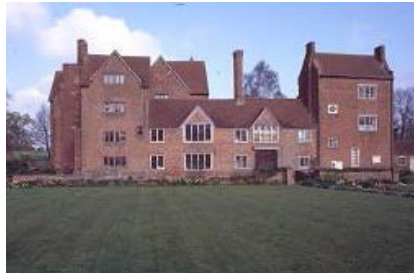
Figure 2 Harvington Hall in Worcestershire, a fine example of Elizabethan Brickwork. The bricks were, it is believed, fired in two nearby fields.

Bricks are among the most durable of building materials. Their use is mentioned in the bible and the Romans introduced their use to the UK but it was not until the 14th century that their use spread as they were reintroduced by Flemish refugees into East Anglia and gradually the sight of yellow “stocks” became common in London. The great fire of London in 1666 encouraged the introduction of brick partition walls in domestic construction and the use of bricks became more widespread although until the 18th century, most UK houses were still built from stone, wood or clay.