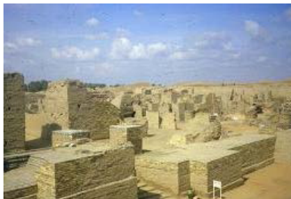
Figure 1: The city of Babylon where bricks were used some 6,000 years ago

Bricks are among the most durable of building materials. Their use is mentioned in the bible and the Romans introduced their use to the UK but it was not until the 14th century that their use spread as they were reintroduced by Flemish refugees into East Anglia and gradually the sight of yellow “stocks” became common in London. The great fire of London in 1666 encouraged the introduction of brick partition walls in domestic construction and the use of bricks became more widespread although until the 18th century, most UK houses were still built from stone, wood or clay.