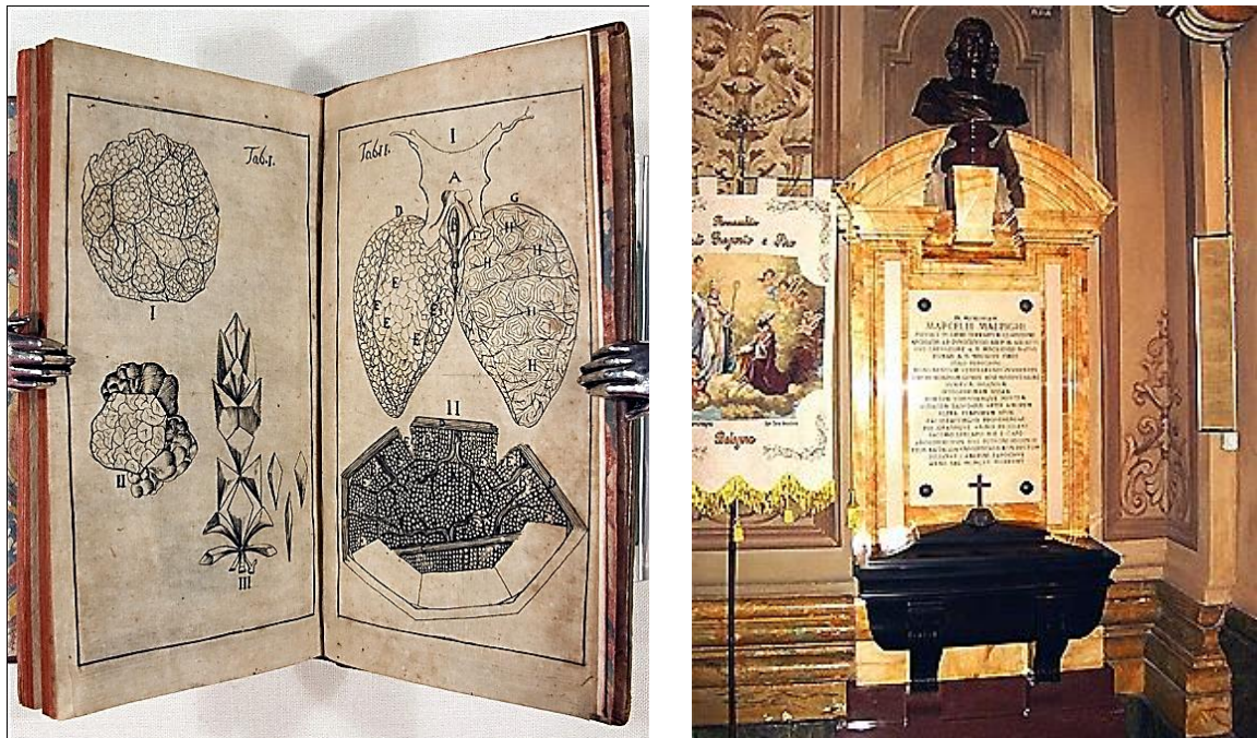
Fig. 5 – Illustration from the Malpighi book describing the 'pulmonary capillaries' (left) and the place where Malpighi is buried in Bologna (right).

William Harvey (1578-1657) was an English physician who studied at the University of Padova, a disciple of Fabrizio d'Acquapendente (1533-1619) (who built the Anatomical Theater in Padua, where he taught for 50 years; the exact description of the venous valves). Harvey received his medical degree in 1602 and maintained a long friendship with D'Acquapendente for a lifetime. It was Harvey's interest in D'Acquapendente 's work, 'De Venarum Ostioliis,' which led him to study the circulation of blood.