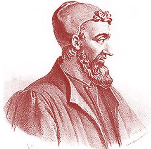
Fig. 3 - Galen