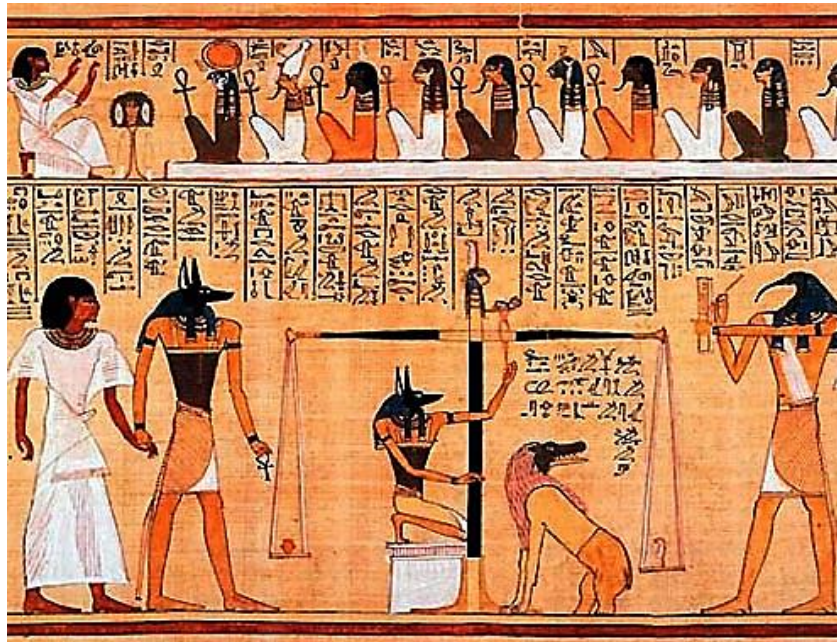
Fig. 1 Weighing the heart at the resurrection ceremony

The Ebers papyrus (1550 BCE) deals with the 'heart' theme and regards the organ as the center of the blood supply, with vessels attached to each limb of the body. The Egyptians knew little of the function of the kidneys and made the heart the meeting point of numerous vessels that carry the body fluids - blood, tears, urine, and sperm.