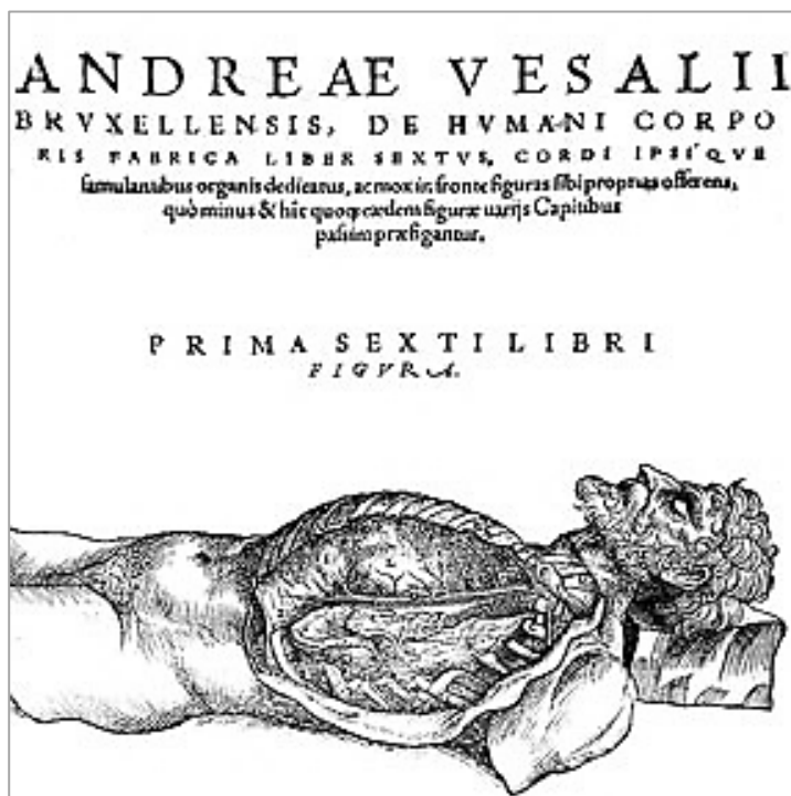
Fig. 4 – Illustration of the work of Vesalius (1543) with realistic drawing of a dissection.

The first significant challenge of Galen's doctrine in Europe occurred in the 16th century. Thanks to the advent of the Gutenberg press 4 there was in Europe a collective effort to circulate the works of Galen and Avicenna . Andreas Vesalius (1514-1564) published a treatise on anatomy in 1543, De humani corporis fabrica libri septem 5 , which was a challenge to Galen . Vesalius went from Leuven to Padua, where he can dissect bodies of criminals condemned to death (hangings) without fear of being persecuted. His drawings are detailed descriptions of the human anatomy that evidence the differences about the reports made by Galen (in animals). Many other anatomists who came after Vesalius also challenged 'galenic knowledge,' but it still reigned for another century.