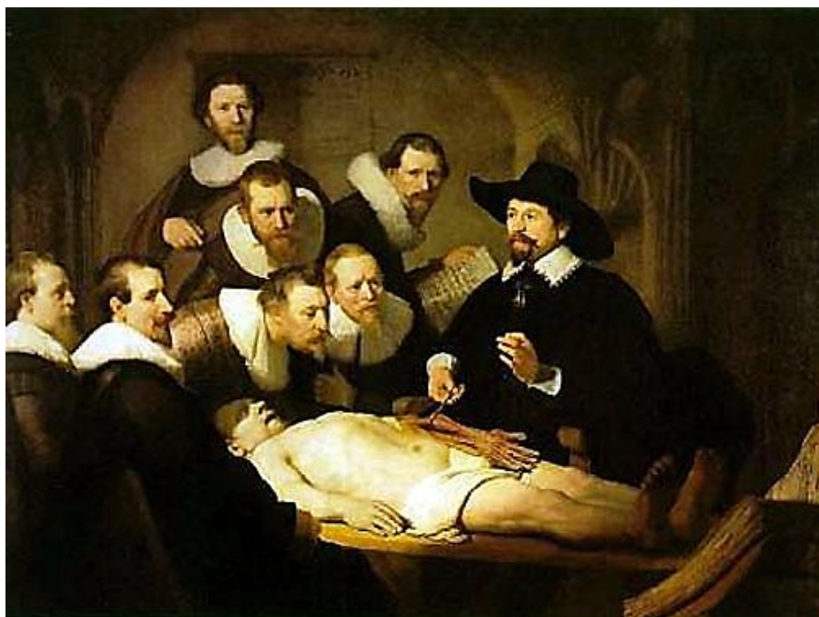
Fig. 9 – Anatomy Lesson of Dr Tulp (Rembrandt).

but was one of the first to propose its role in female sexual pleasure. Fallopio described the uterine tubes ('Fallopian tubes').