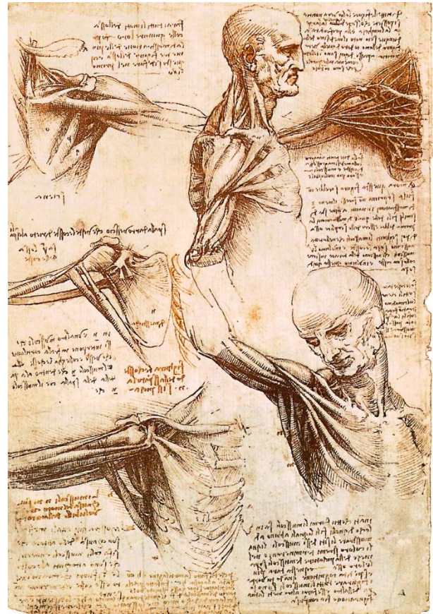
Fig. 8 – Leonardo Da Vinci drew different levels of dissection of a body (possibly that of a 100-year-old elder whom he met still alive, dead on the same day).

Europeans interested in anatomy traveled to Italy, which was the high center of the anatomy of the time. Only in Italy was it possible to dissect a woman's body, for example. Renaldus Columbus (1516-1559) and Gabriele Falloppio (1523-1562) were disciples of Vesalius . Columbus was his successor in Padua and later a professor in Rome. Columbus accurately described the bones, the shape of the heart cavities, the pulmonary artery, the aorta, and their leaflets, and traced the course of blood from the right side to the left side of the heart. Also, it made a good report of the encephalon and its vessels and the ventricle of the larynx. The name of Columbus is also associated with the description of the clitoris (which he considered Amor Veneris, Vel Dulcedo Appelletur , that is, "must be called love or sweetness of Venus"). Columbus was not the first to designate the clitoris