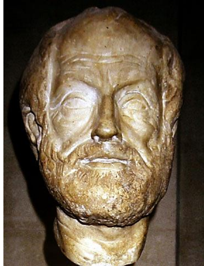
Fig. 2 - Aristotle (Louvre Museum)

current expertise than any other until that time. The Greek Theophrastus (? - 287 BCE), a disciple of Aristotle , also carried out dissections in humans. He coined the term 'anatomy' (Greek, 'anna temnein'), which became generalized, encompassing the whole field of biology that studies the form and structure of living beings, existing or extinct.