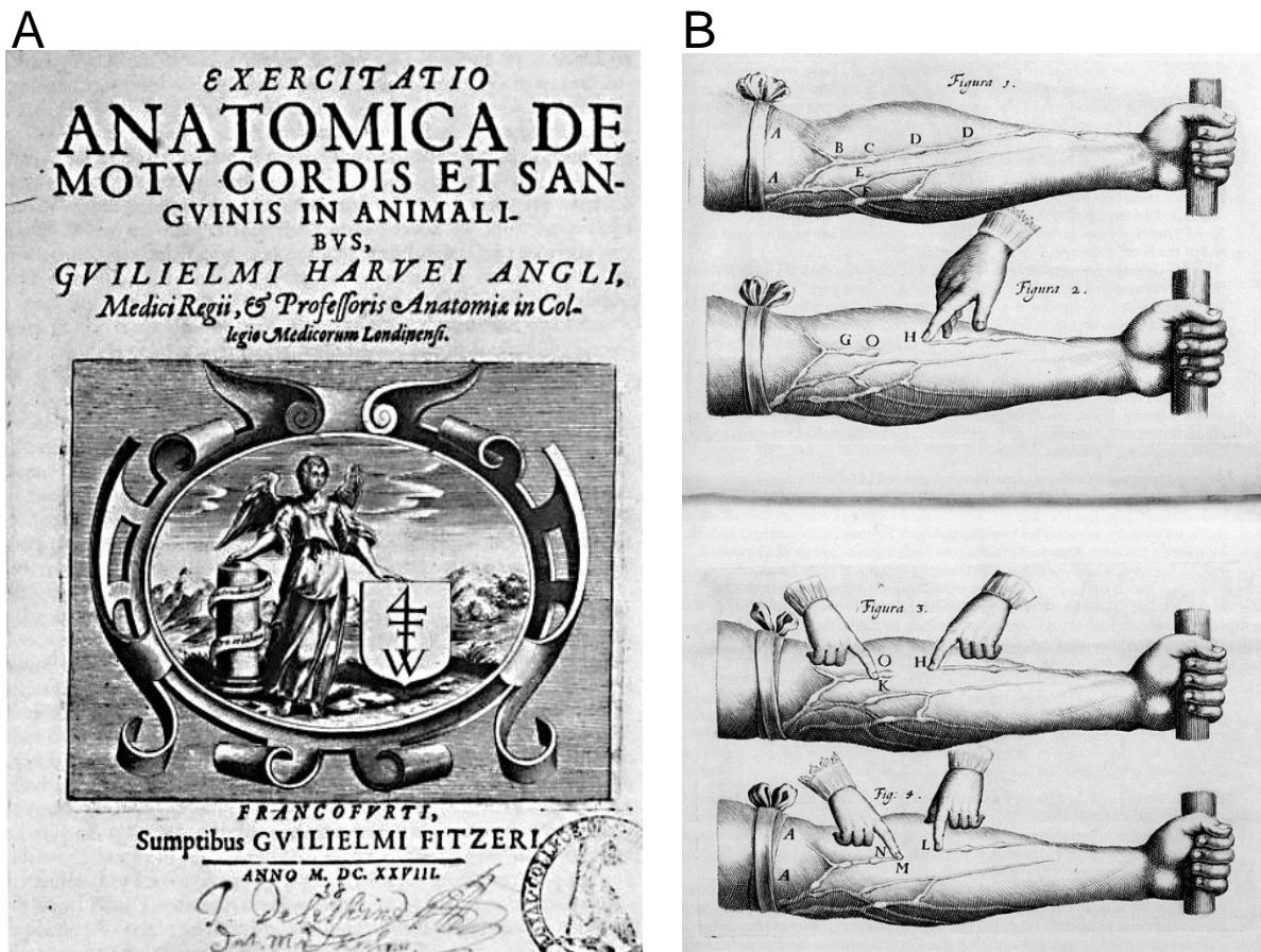
Fig. 6 – Illustration from Harvey's book on blood circulation. A - Frontispiece of the book (Thesis), B - direction of blood flow in the veins of the forearm.

Many famous artists studied anatomy, dissected bodies and published their drawings for money, from Michelangelo and Da Vinci to Rembrandt . Leonardo Da Vinci (1452-1519) learned anatomy with Andrea del Verrocchio (1435-1488). As an artist, he quickly became master of topographical anatomy, designed many studies of muscles, tendons and other anatomical parts, always seeking perfection. Being a successful artist, he was allowed to dissect human bodies at the Hospital of Santa Maria Nuova in Florence and then in hospitals in Milan and Rome.