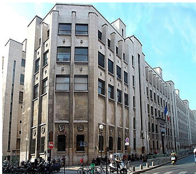
Fig. 10 – UFR Biomédicale des Saints-Pères (Université René Descartes, Paris V), where the Société Anatomique de Paris still operates today.

Jan Evangelista Purkinje (1787-1869) discovered in 1839 fibers in the subendocardium of the ventricles ('Purkinje fibers' of the conduction system of the heart). Walter Gaskell in 1886 described specialized muscle fibers connecting the atria and ventricles, which when sectioned cause blockage. It also identified the area of onset of cardiac excitation in the region derived from the venous sinus. Wilhelm His, Jr (1863-1934) examined a series of histological sections of the heart of human embryos and showed that there is connective tissue surrounding a beam from the right atrium to the ventricles, the bundle of His. Sunao Tawara (1873-1952) followed the 'bundle of His' (atrioventricular, AV) to its connection with the 'compact' portion of the AV node at the base of the interatrial septum. Tawara concluded that the 'AV connection system' originates from the AV node, penetrates the septum (like the His bundle) and divides into right and left branches ending in the 'Purkinje fibers.' Arthur Keith (1866-1955) and Martin Flack (1882-1931) found, in 1907, a peculiar structure at the sinoatrial junction that recalled the structure of the AV node; they considered that the heart rhythm started there and called it the sinoatrial node region. In 2006 and 2007 was celebrated the 100th anniversary of the anatomical discoveries of the cardiac conduction system.