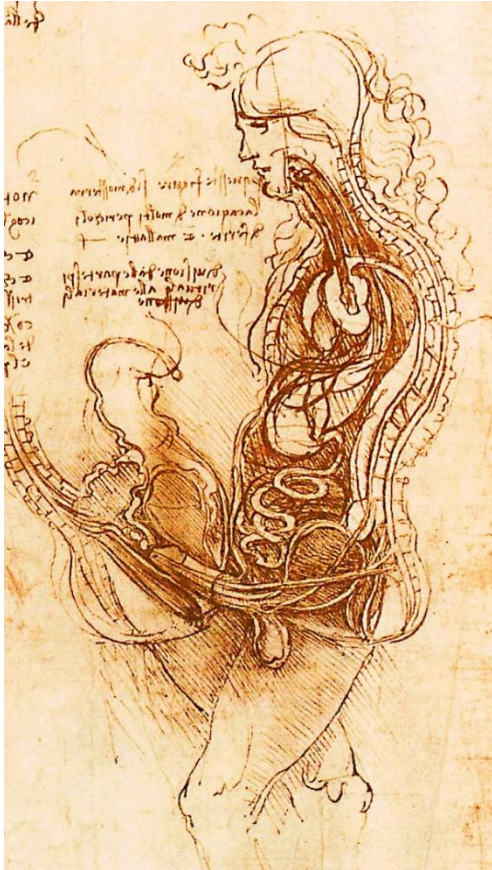
Fig. 7 – Drawing by Leonardo Da Vinci illustrating copulation.

Many European cities such as Amsterdam, London, Copenhagen, Padua, and Paris had Anatomical Academies held by the local government. Thus, Nicolaes Tulp 7 , mayor of Amsterdam, can perform numerous dissections and public demonstrations (Fig. 9). At that time, students traveled through Europe where bodies were available (hanged, for example) to perform dissections (no way to keep bodies in study conditions long after death and their dissection should be done quickly).