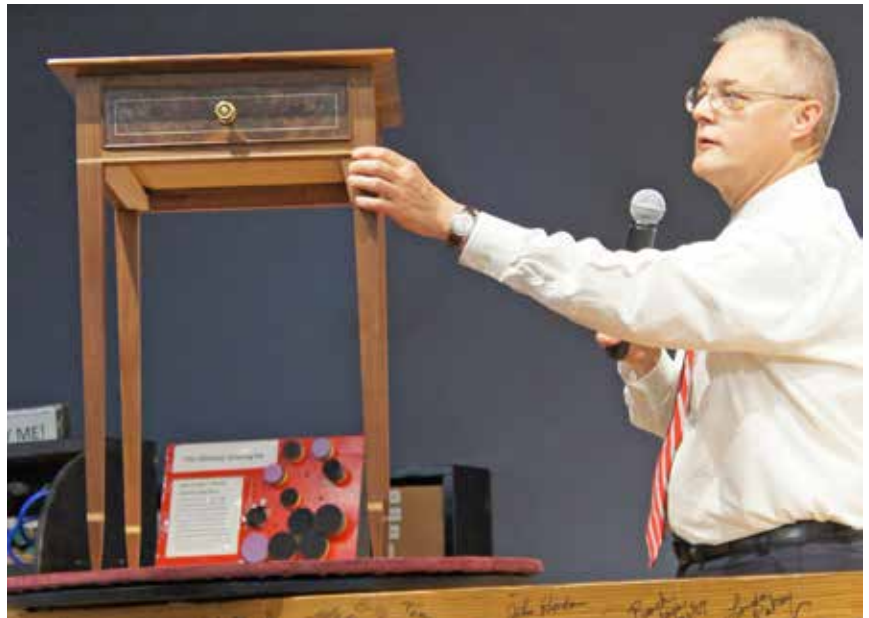
Federal Side Table by Charlie LeGrand