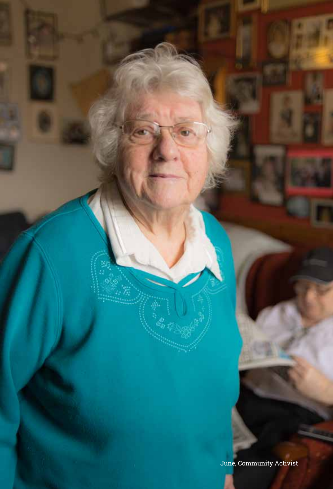
June, Community Activist