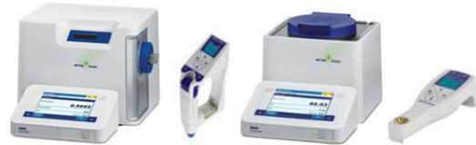
Digital Density Meters Digital Refractometers

Brix Hydrometers are widely used for measurement of Brix. They have a relatively good resolution of \pm 0.05 on syrup and \pm 0.02 Brix on beverage, and are available at reasonable prices. One disadvantage of Hydrometers is that due to different operators and the way of working (e.g. put down the hydrometer calmly) the results may differ a lot. The Hydrometers are made of glass and therefore highly breakable.