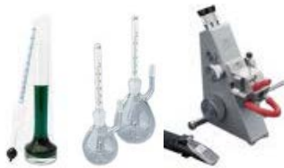
Brix Hydrometer, Pycnometer, Abbe Refractometer