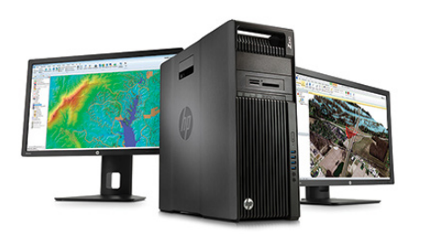
HP Z640 Workstation interactive tour