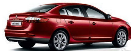
ORIENTAL RED (NXD) M