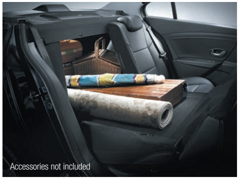
Accessories not included