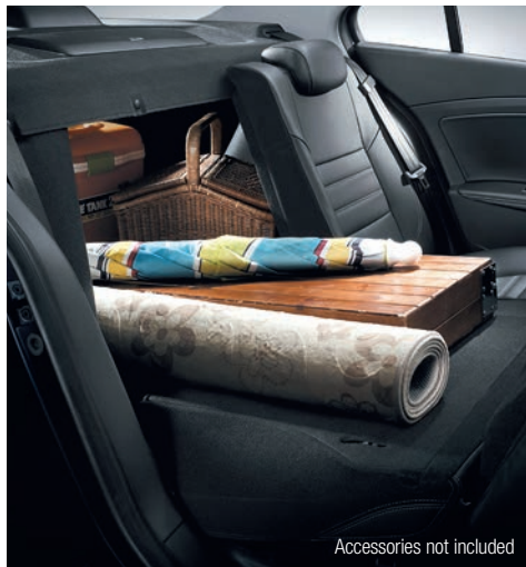
Accessories not included

The digital speedometer in the Renault Fluence allows you to see your exact speed at a particular instant. This precise knowledge is particularly helpful when moving from one speed limit to another and, in conjunction with cruise control, assists you to always be in control of your speed.