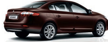
METALLIC BROWN (CXA) M