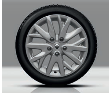
EPTIUS 16" ALLOY WHEELS