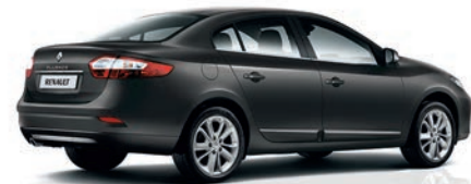
MARS GREY (WXC) M