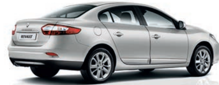
PEARL WHITE (QXA) M