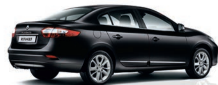
BLACK (GXA) M