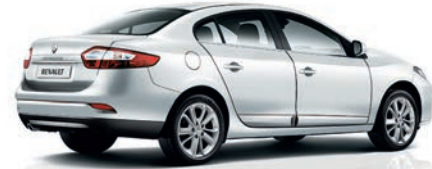
WHITE (QXB) S