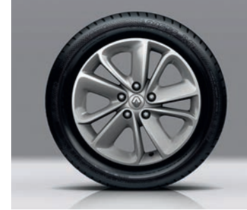
PRAGMA 17" ALLOY WHEELS