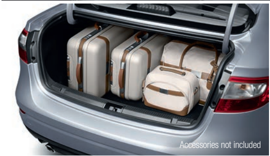
Accessories not included