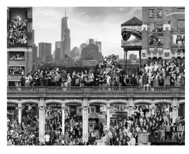
JR: Chronicles Now on view through October 18, 2020 Great Hall, 1st Floor

The artist's first major exhibition in North America traces JR's career from his early documentation of graffiti artists as a teenager in Paris to his large-scale architectural interventions in cities worldwide to his recent digitally collaged murals that create collective portraits of diverse publics. The centerpiece of the exhibition is The Chronicles of New York City, a soaring multimedia mural of more than one thousand New Yorkers and their stories.