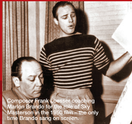
Composer Frank Loesser coaching Marlon Brando for the role of Sky Masterson in the 1950 film – the only time Brando sang on screen.

Guys and Dolls has been revived many times on both sides of the Atlantic.