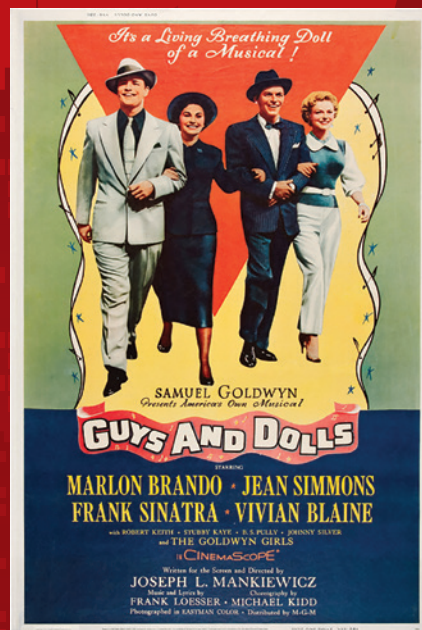
Poster for the 1950 film version.