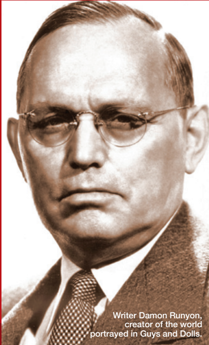
Writer Damon Runyon, creator of the world portrayed in Guys and Dolls .