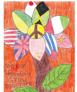
Created by Ian Hjortensjo

Choose Peace Week is an annual event spearheaded by United Way of Broward County, created to promote safe, and violence-free environments, and celebrate peace and inclusivity. Weekly activities were held that promoted peace and taught the youth how to live peacefully with one another. Parks' Out-of-School-Time Program campers participated in the poster contest with the theme "Shaping Peace Together," which inspired plenty of creativity from the campers while also teaching them to love one another. Some of the campers' artworks were showcased on the Choose Peace Website. Choose Peace/Stop Violence | United Way Broward