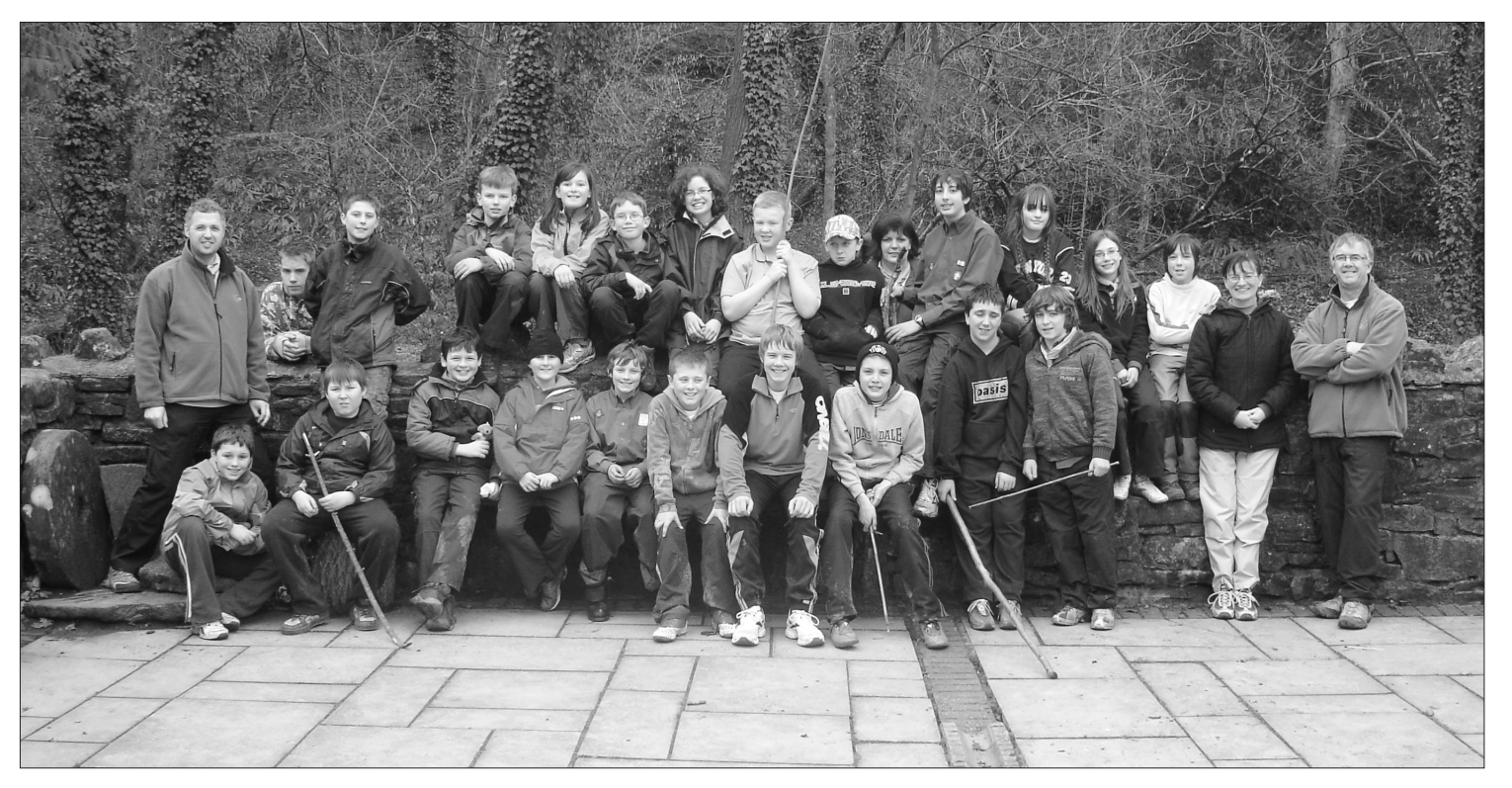
www.morganstown.org.uk is ... a one-stop shop for local information