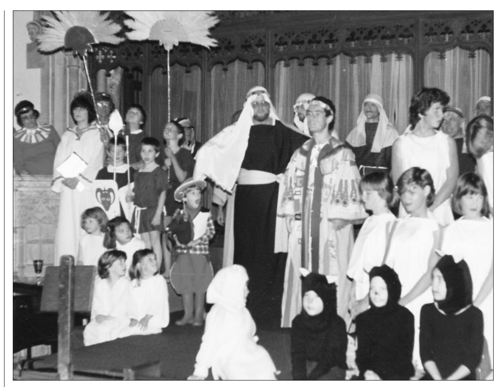
"Joseph and his Amazing Technicolor Dreamcoat"

In following years the Group staged "Captain Noah & Swingin' Samson" and "Jesus Christ Superstar" at Christ Church. This latter production perhaps being the most evocative for many of the cast – some of whom are still