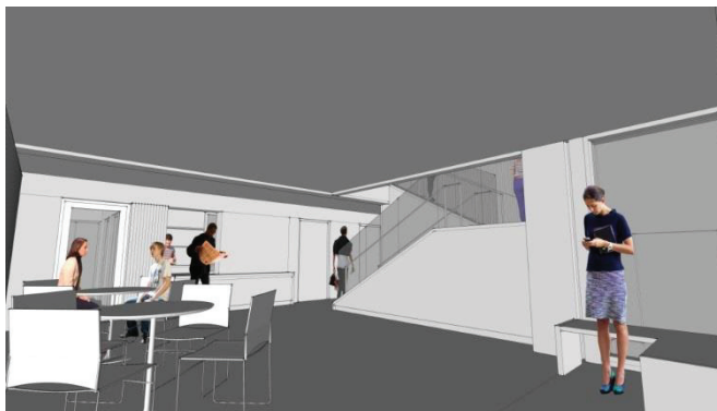
New foyer - Halls

The halls are badly in need of attention to both the fabric and the décor. However, beyond this there is the opportunity to develop them into a much more welcoming facility. Currently, the aspect they present to the outside world is of a closed off area. The entrance is narrow and once inside the space the corridors are not conducive to easy circulation. There are problems with access and 'parking' for push chairs and buggies.