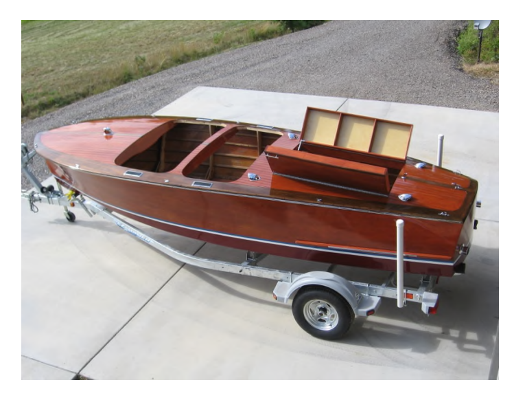
"Hardware being installed. Motor hatches open."