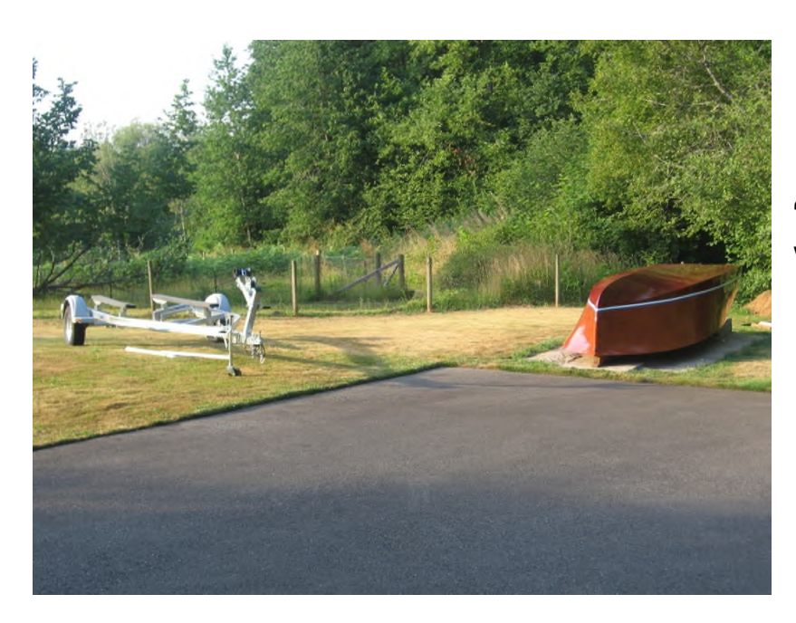
"The trailer is waiting."

I enlisted the help of 16 friends to help me lift the boat off the jig and set it on the trailer. It was surprisingly easy to lift it with that much help. The move went very smooth. We lifted it off the jig and rolled it over on an old mattress pad to protect the hull finishes. Once we had it upright it was easy for us all to lift it high enough to get it onto the trailer.