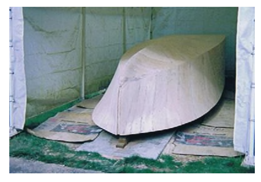
"The hull subsheathing is complete and ready for installation of mahogany sheathing."

The 1/8" thick x 3" wide mahogany strips are laid in a bed of epoxy over the sub-sheathing. The strips of mahogany are temporarily fastened in place with 3/4" long x 18 ga staples. Each staple is shot through a 2" x 2" x 1/4" plywood pad that is wrapped in plastic wrapping tape and placed over the mahogany strips at about 3" oc or less. The tape keeps the plywood pads from sticking to the mahogany where it touches excess epoxy that might be on the surface of the mahogany. Once the epoxy has set up, the pads and staples are removed. There was close to 4 thousand staples used to hold the mahogany strips in place on this boat. That amounted to a whole lot of staple pulling.