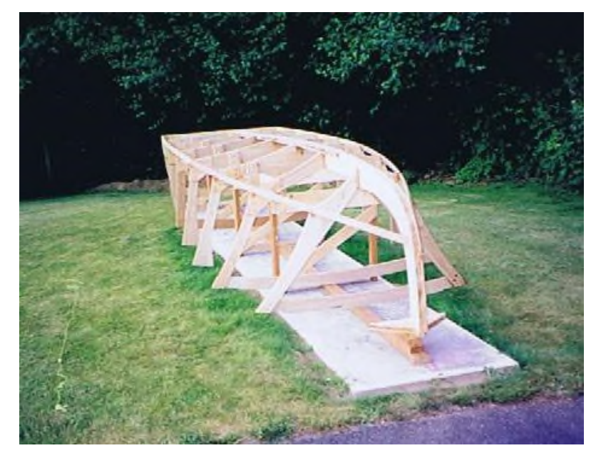
"The framing on Jig beginning to take shape."