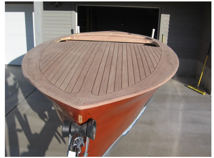
"Decking installed and ready to be finished."