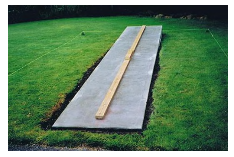
"The concrete slab to build the jig on."

no level surfaces in the yard so I poured a level 3' wide and 20' long concrete pad in the lawn area for my jig set up location.