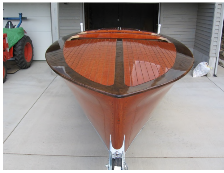
"Deck has been finished, ready for white joint deck caulking and installation of hardware."