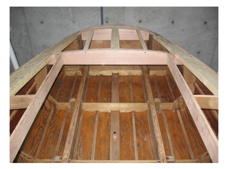
"Deck framing started."