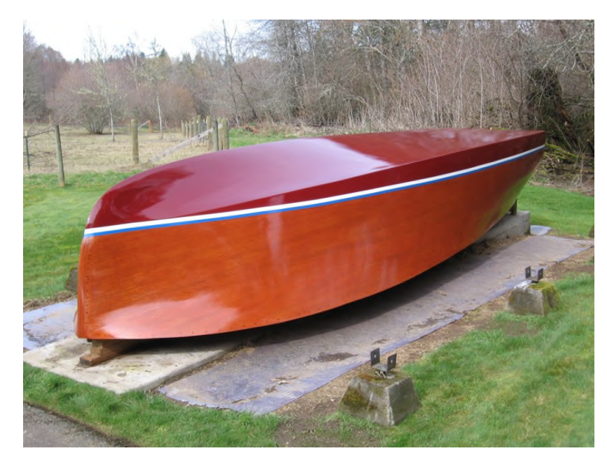
"The end of July 2009 the boat is ready to move off the Jig and onto the trailer. Everything is being moved out of the way and all fasteners holding the frame to the jig have been removed."