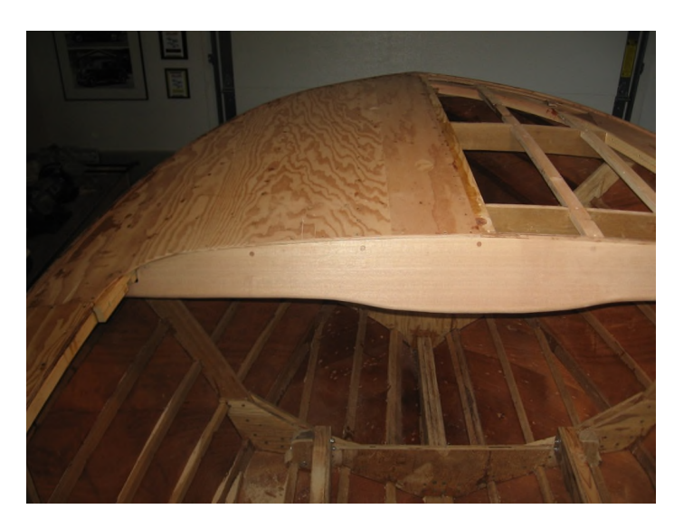
"Sub deck sheathing being installed.