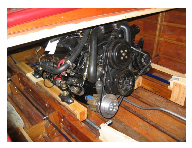
"Engine view with rear seat removed. The rear seat back can be removed to expose opening in rear seat back support that allows access to the front of the engine for maintenance."