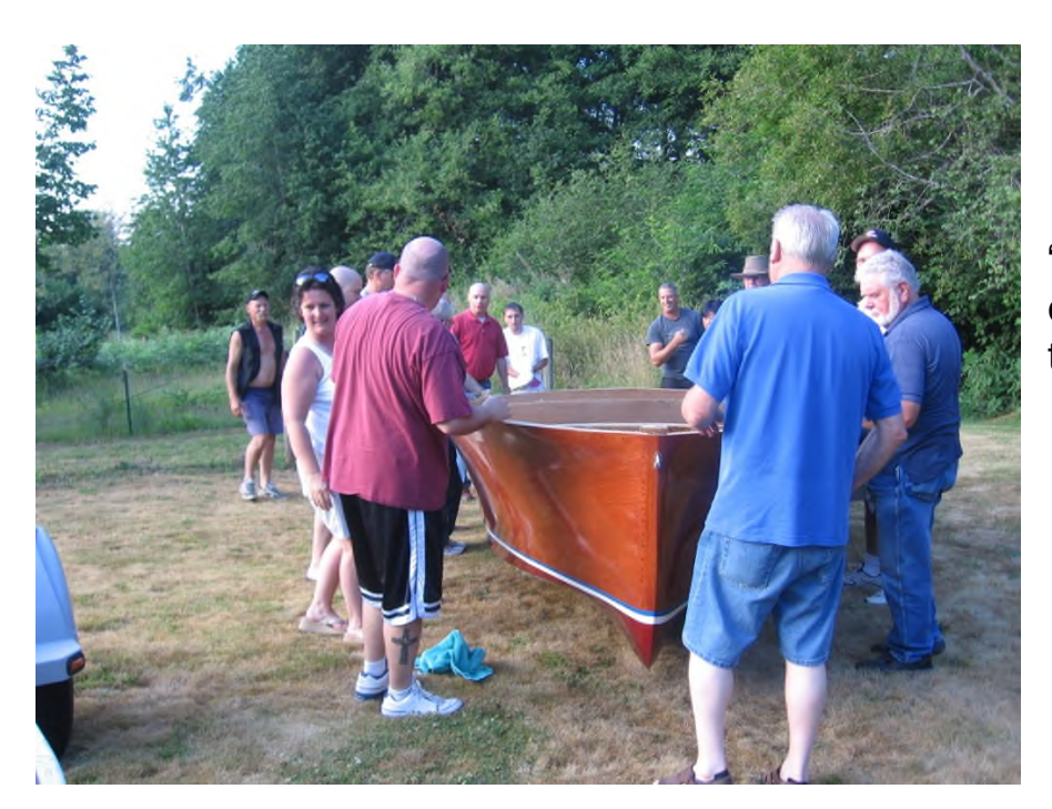
"Next move is on to the trailer."

After it was on the trailer it was ready for the move to Idaho. This was the last item to be moved to our new home. The few odds and ends we still had to move were loaded in the boat and we were on our way to Idaho.