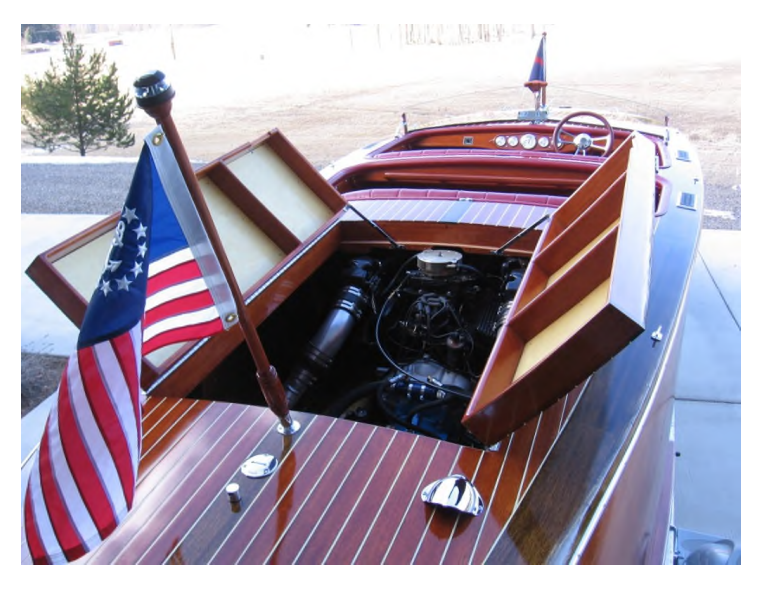
"Engine installation complete with motor hatch doors reinstalled."

In the spring of 2012 and the boat is finally complete. I'm looking forward to warmer weather, a higher water level in the lake and a chance to launch this boat on its maiden voyage. Wow, is this going to be fun!