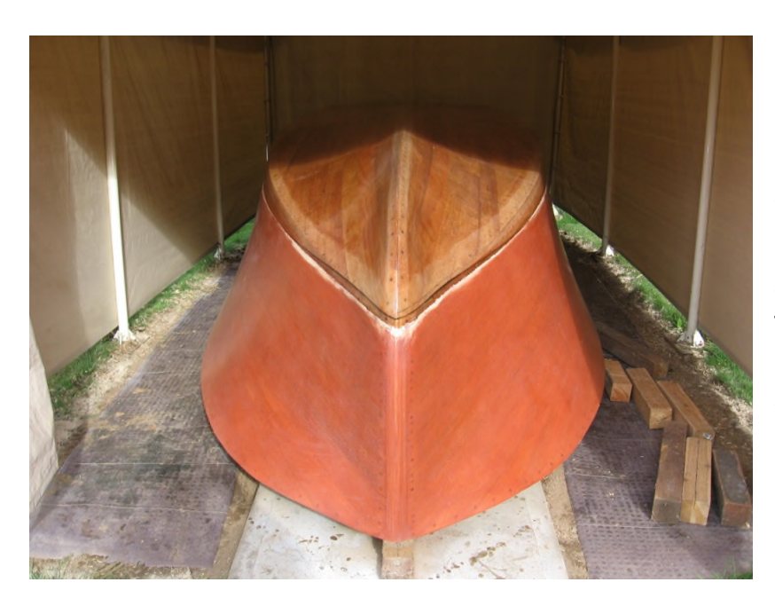
"The bottom has been fiberglassed and the sides of the hull & transom have been stained."

When the mahogany strips had all been installed, the whole surface was sanded smooth and prepared to receive fiberglass on the bottom of the hull up to the water line. Before fiberglassing, I drilled the holes for the propeller shaft and rudder shaft. The sides of the hull and transom were stained with Chris Craft red/brown stain.