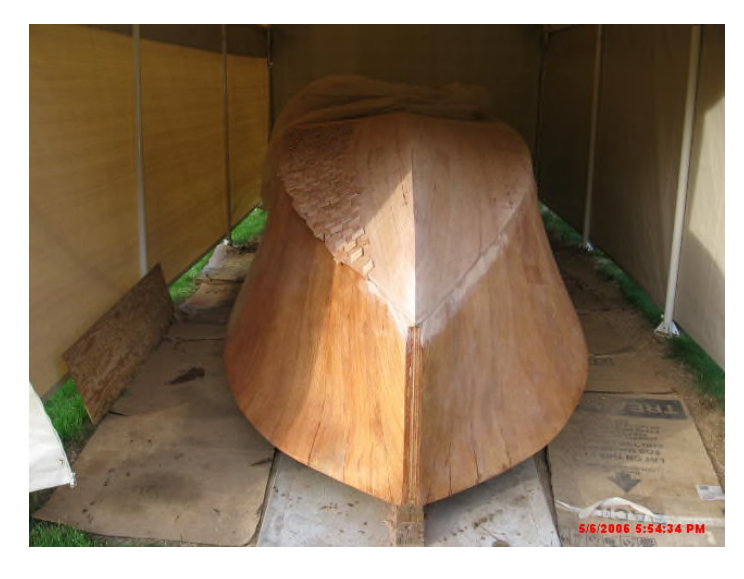
"Mahogany sheathing strips are being installed on the bottom of the hull."

The 1/8" thick x 3" wide mahogany strips are laid in a bed of epoxy over the sub-sheathing. The strips of mahogany are temporarily fastened in place with 3/4" long x 18 ga staples. Each staple is shot through a 2" x 2" x 1/4" plywood pad that is wrapped in plastic wrapping tape and placed over the mahogany strips at about 3" oc or less. The tape keeps the plywood pads from sticking to the mahogany where it touches excess epoxy that might be on the surface of the mahogany. Once the epoxy has set up, the pads and staples are removed. There was close to 4 thousand staples used to hold the mahogany strips in place on this boat. That amounted to a whole lot of staple pulling.