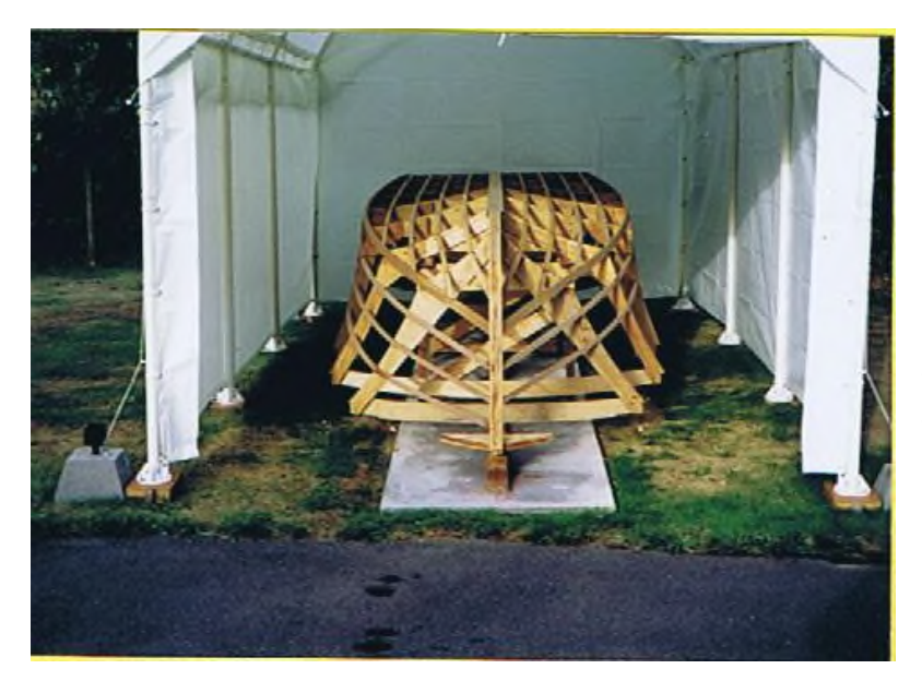
"The frame a little more complete with the canvas carport for weather protection."