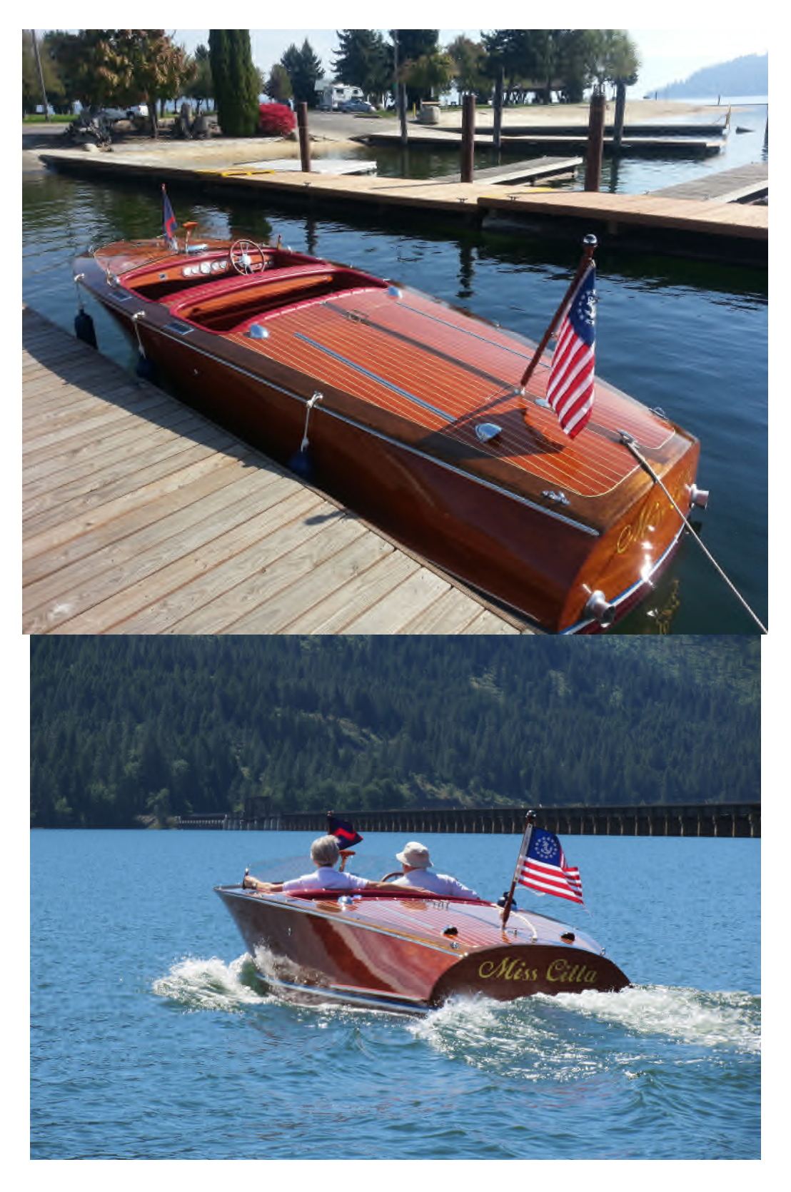
Let The Fun Begin!!!