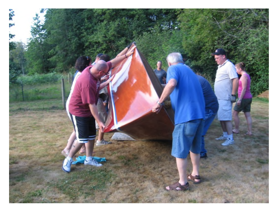
"Rolling the hull over on a mattress pad."