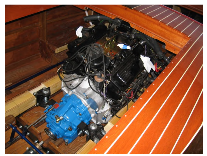
"Engine in place. It's a tight fit but it works."