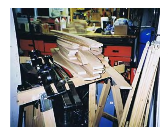
"Cut out frame members"

In February 2001 I bought the plans from Ken Hankinson. I began cutting out framing members and transferring the 1/2 frame full size drawings to a 4' x 8' x 3/4" plywood to use as a layout table to construct the frames on.