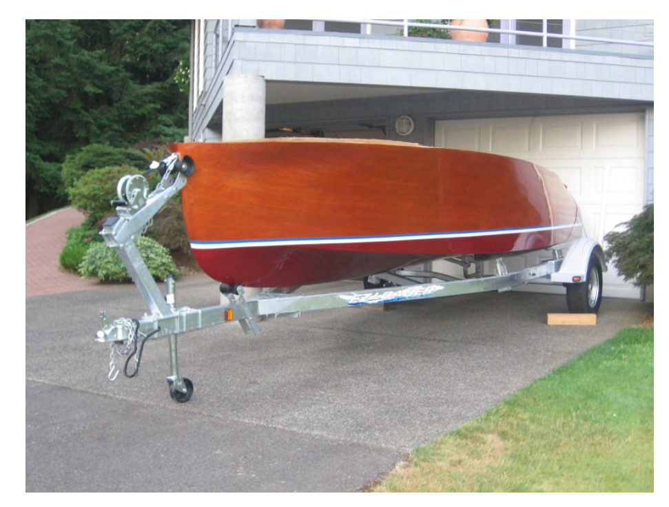
"On the trailer and ready to move."