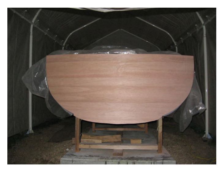
"Transom mahogany sanded and ready for paint and stain."

When the mahogany strips had all been installed, the whole surface was sanded smooth and prepared to receive fiberglass on the bottom of the hull up to the water line. Before fiberglassing, I drilled the holes for the propeller shaft and rudder shaft. The sides of the hull and transom were stained with Chris Craft red/brown stain.