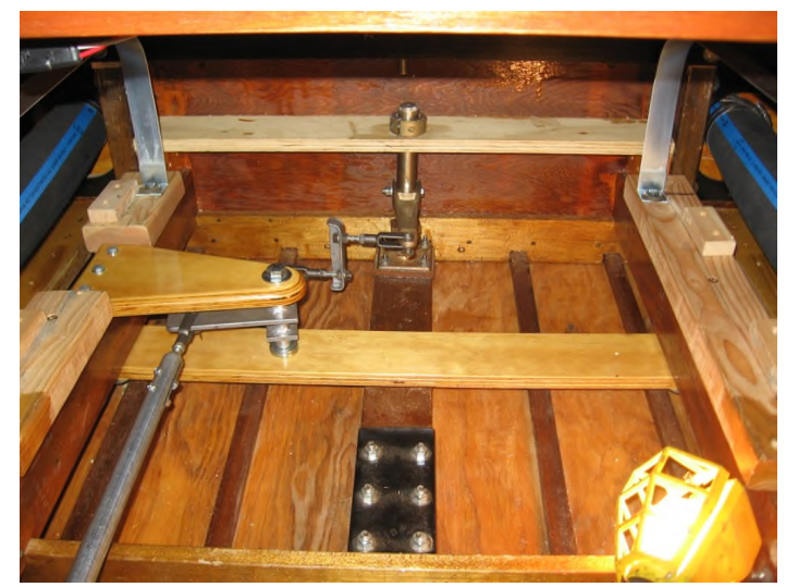
"Rudder control linkage."