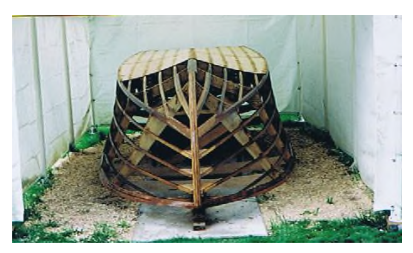
"The frame is complete, faired, and some sheathing is being installed."