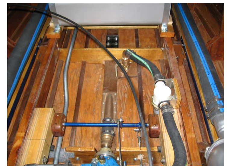
"Raw water pickup and filter."