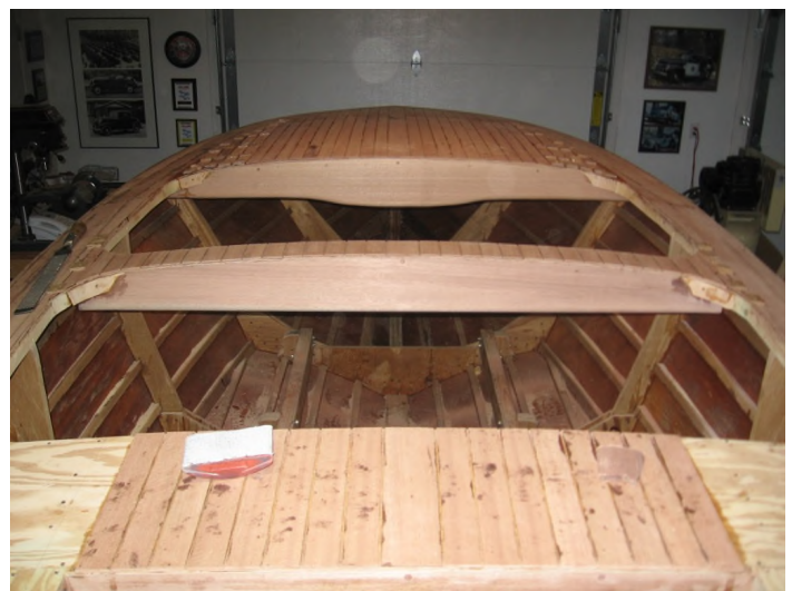
"Mahogany deck surface being installed."