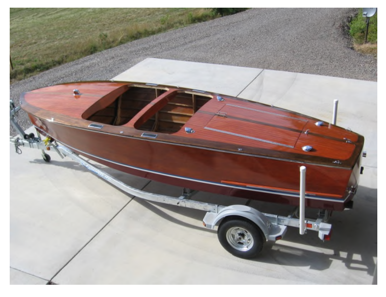
"Hardware being installed."