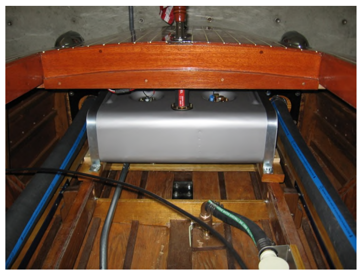
"Fuel tank installed. Exhaust tubing installed and connected to exhaust ports."