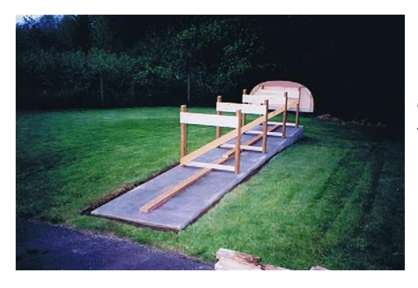
"Beginning to set up frame jig"

The next step was to set up the frame jig so construction could begin. I set the jig up in September 2001.