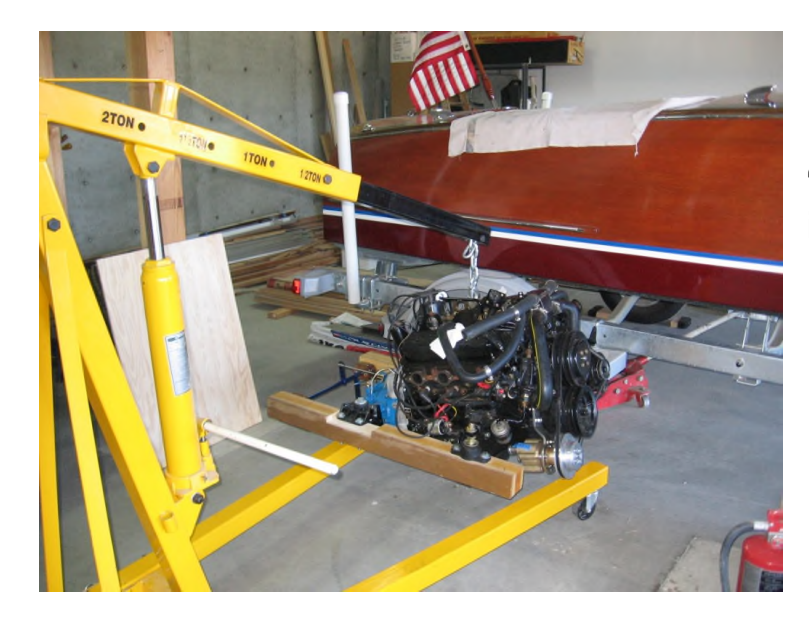
"Engine ready for installation."

possible to connect the engine to a Borg Warner Velvet Drive 71C transmission. I bought the new transmission from a company in North Carolina. I ordered new mounts that attached to the front of the engine and to the transmission. The engine and transmission were attached to short runners that were spaced to fit between the main engine stringers that were built into the boat framing during construction.