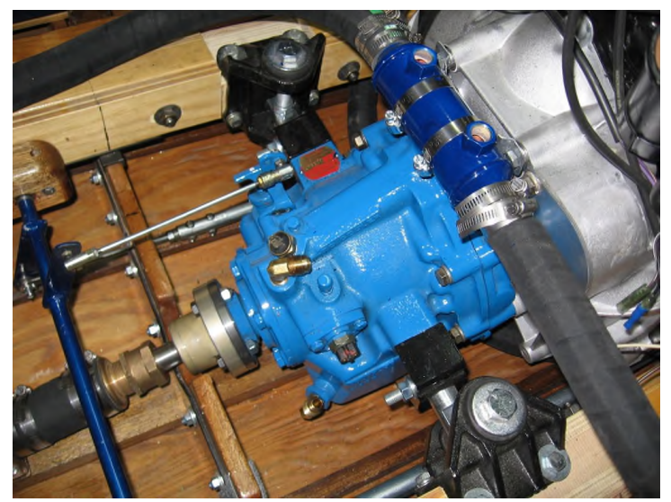
"Transmission linkage and transmission oil cooler in place."