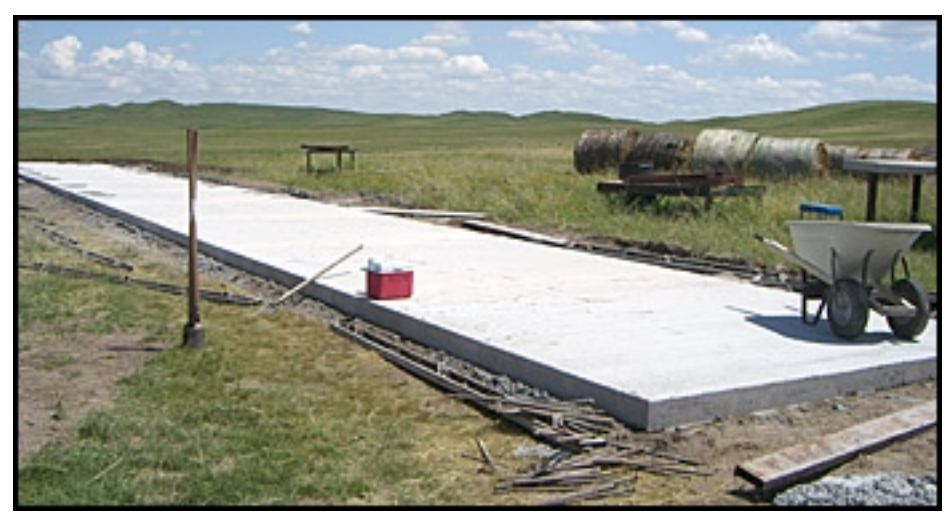
Step Four - Firing Line