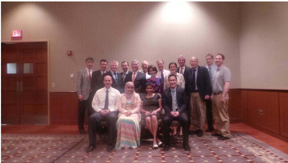
Faculty with graduating Class of 2014.