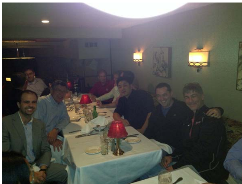
OSU Perio Alumni Dinner