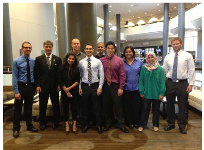
Ohio Dental Association Meeting