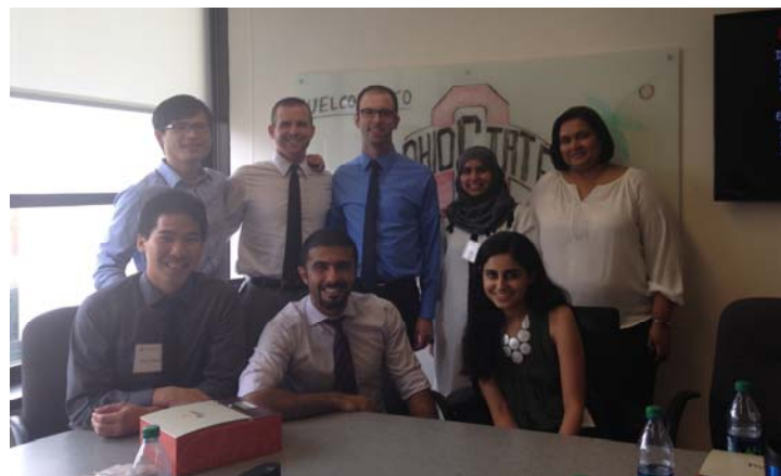
Current first and second year residents.