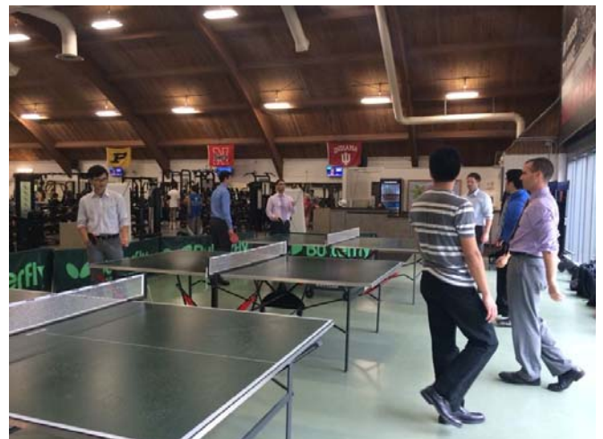
Third Annual Tie Ping Pong Tournament!