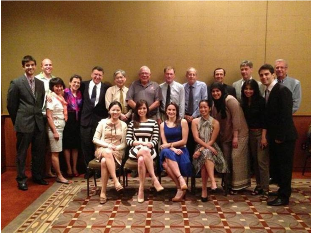
Periodontal graduating Class of 2013 with faculty and other residents.