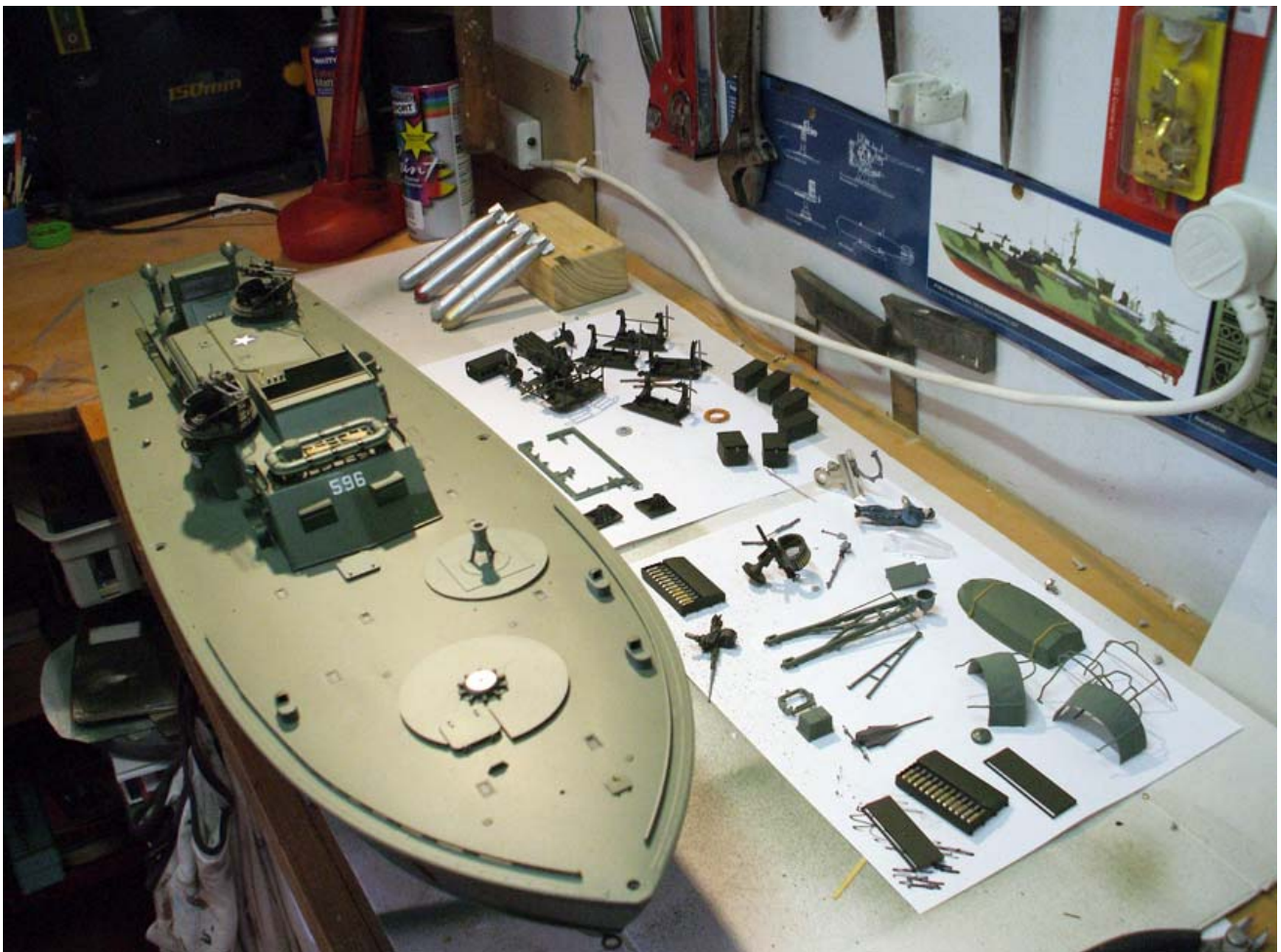
Finally ready for assembly.