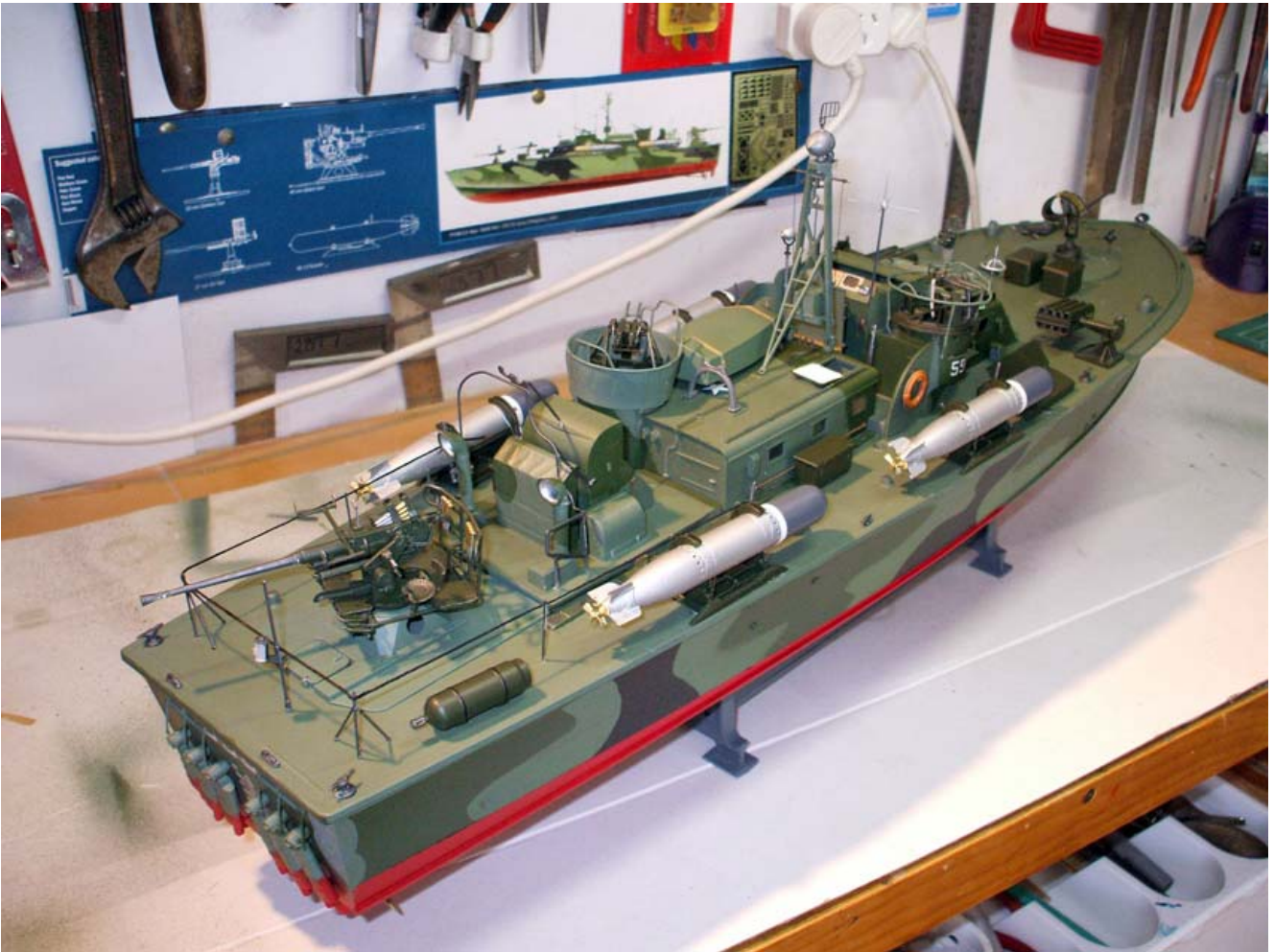
Assembled on the workbench awaiting final matt varnish.