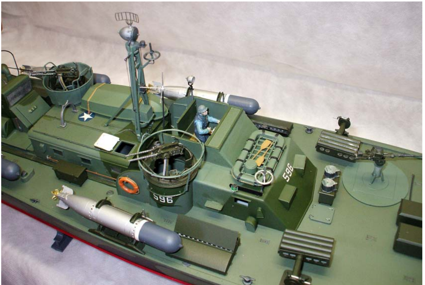
Crew member altered from another kit.