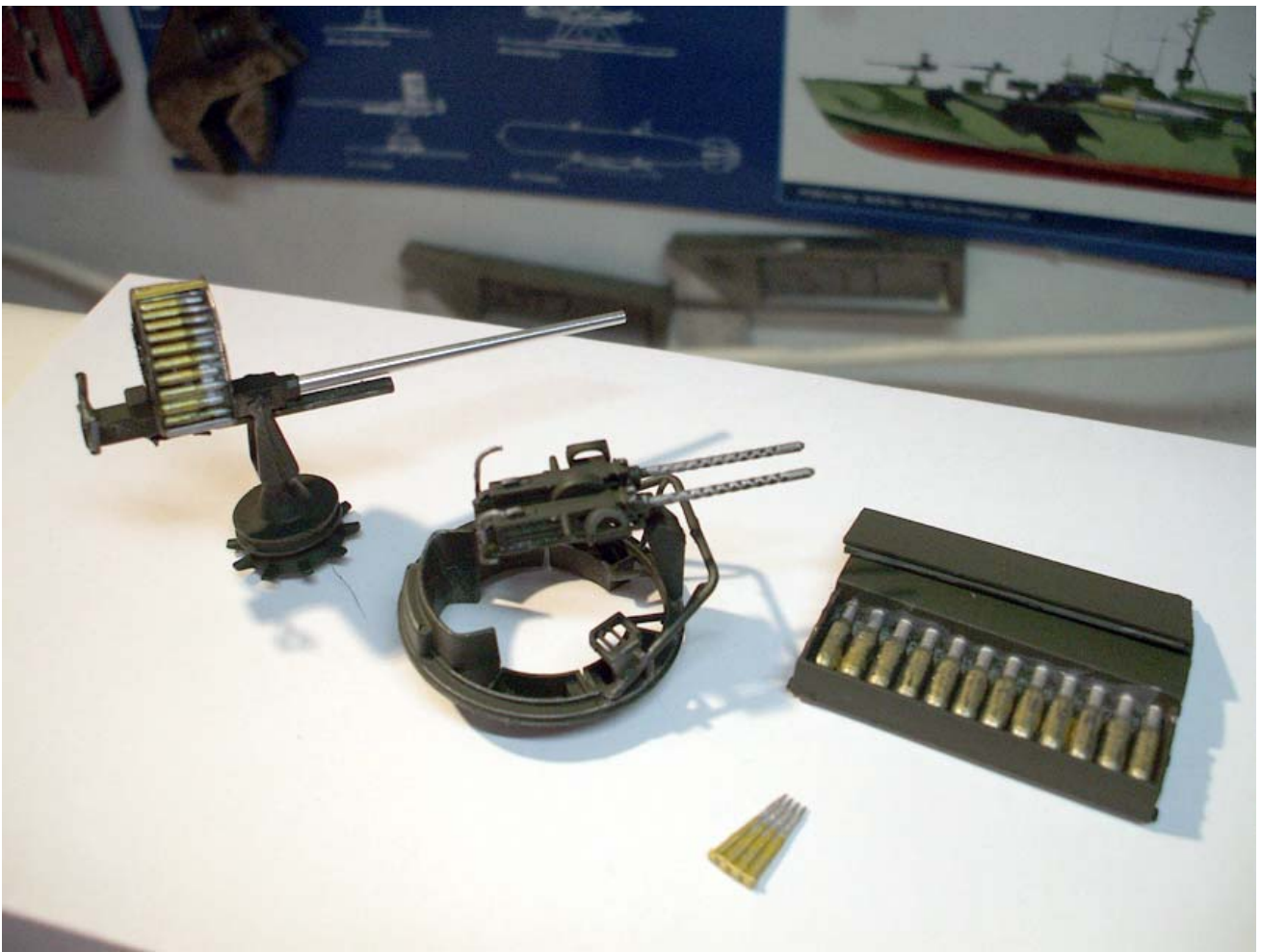
Picking out the ammunition in gold and silver makes it realistic.