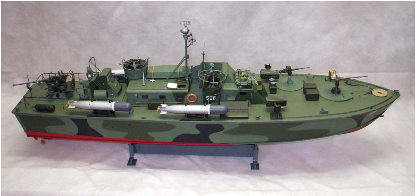
This is the finished model.

This is a great build and I did it in about 70 hours. What would I change? Pity that the deck was not made to look as if it was wooden planked. It looks ridiculous the way they have the anchor with a bit of rope to the bow ring. 80 ft long, weighing 60 ton, with a little Danforth and no winch? As I live on the coast of the Pacific Ocean I know how mean it can be. Some figures would also be great considering the price. I am making my own from some left over from the Italeri Landing Craft.