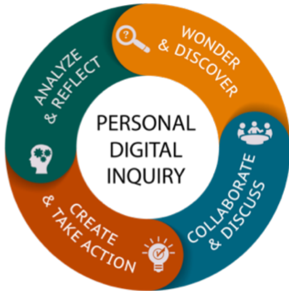
Figure 2. The PDI Framework (reprinted with permission from Coiro, Dobler, & Pelekis, forthcoming)

promising as my colleagues and I turn to documenting exemplars of how teachers and librarians in Grades K-5 are collaboratively using the PDI framework to design personal digital inquiry experiences that promote engagement and deeper learning among students in their classrooms.