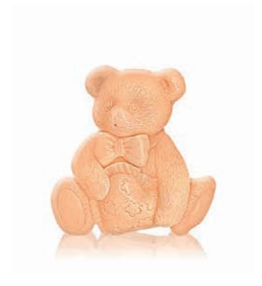
3526 WINNIE THE POOH 70 g