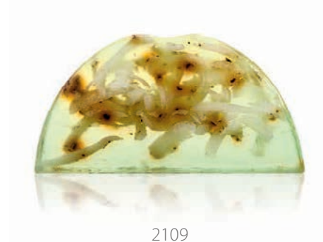
GREEN TEA with green tea extract, coconut and palm oil