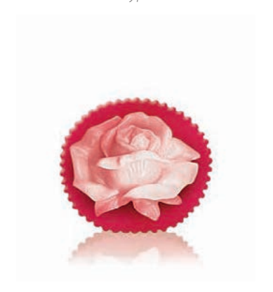
3516 ROSE BLOSSOM 80 g

• Glycerine soaps with a unique combination of cleansing effect and gentle care. Suitable for all skin types.