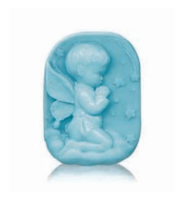
3523 CHILDREN'S CARESS 100 g