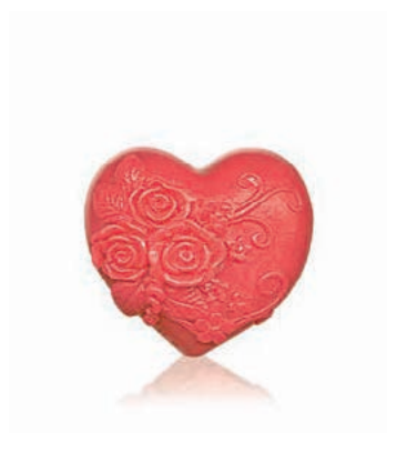
3530 HEART IN LOVE 65 g