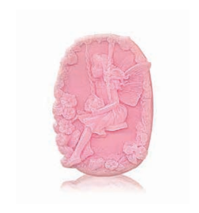
3504 HAPPY CHILDHOOD 105 g