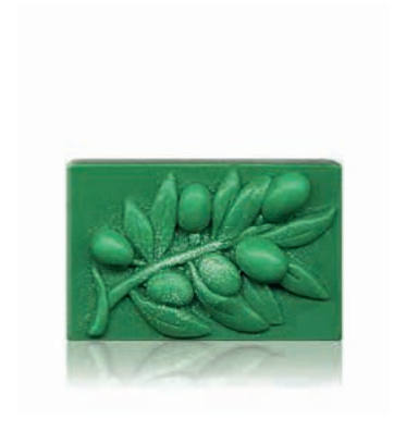
3510 OLIVE 120 g