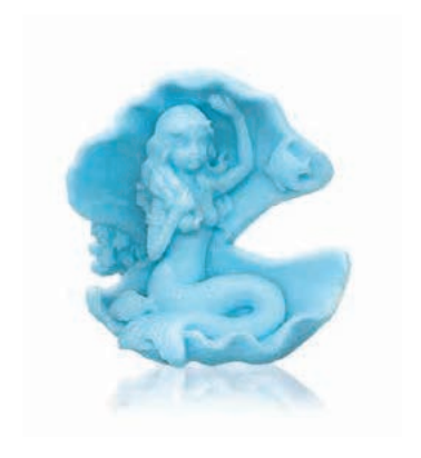
3509 SEA PEARL 110 g