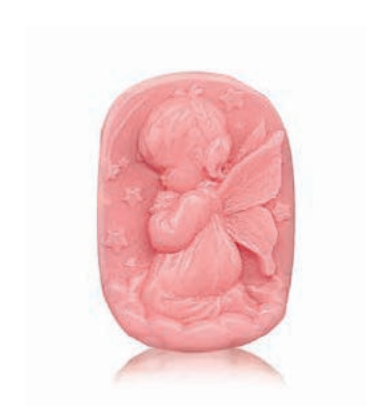
3524 CHILDREN'S PET 100 g