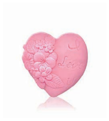
3532 HEART IN LOVE 65 g