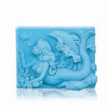
3507 WATER NYMPH 115 g