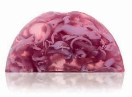
2106 LILAC with coconut and palm oil