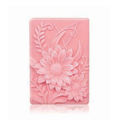
3501 SPRING SCENT 100 g