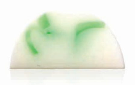
2114 OLIVE-MILK with olive oil, coconut and palm oil