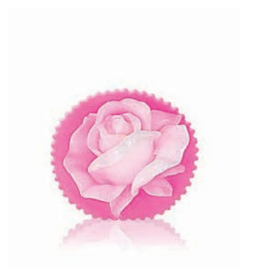
3534 ROSE BLOSSOM 80 g