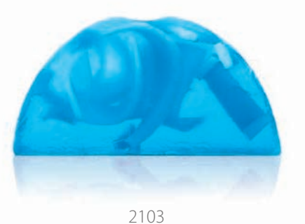
OCEANIC with coconut and palm oil